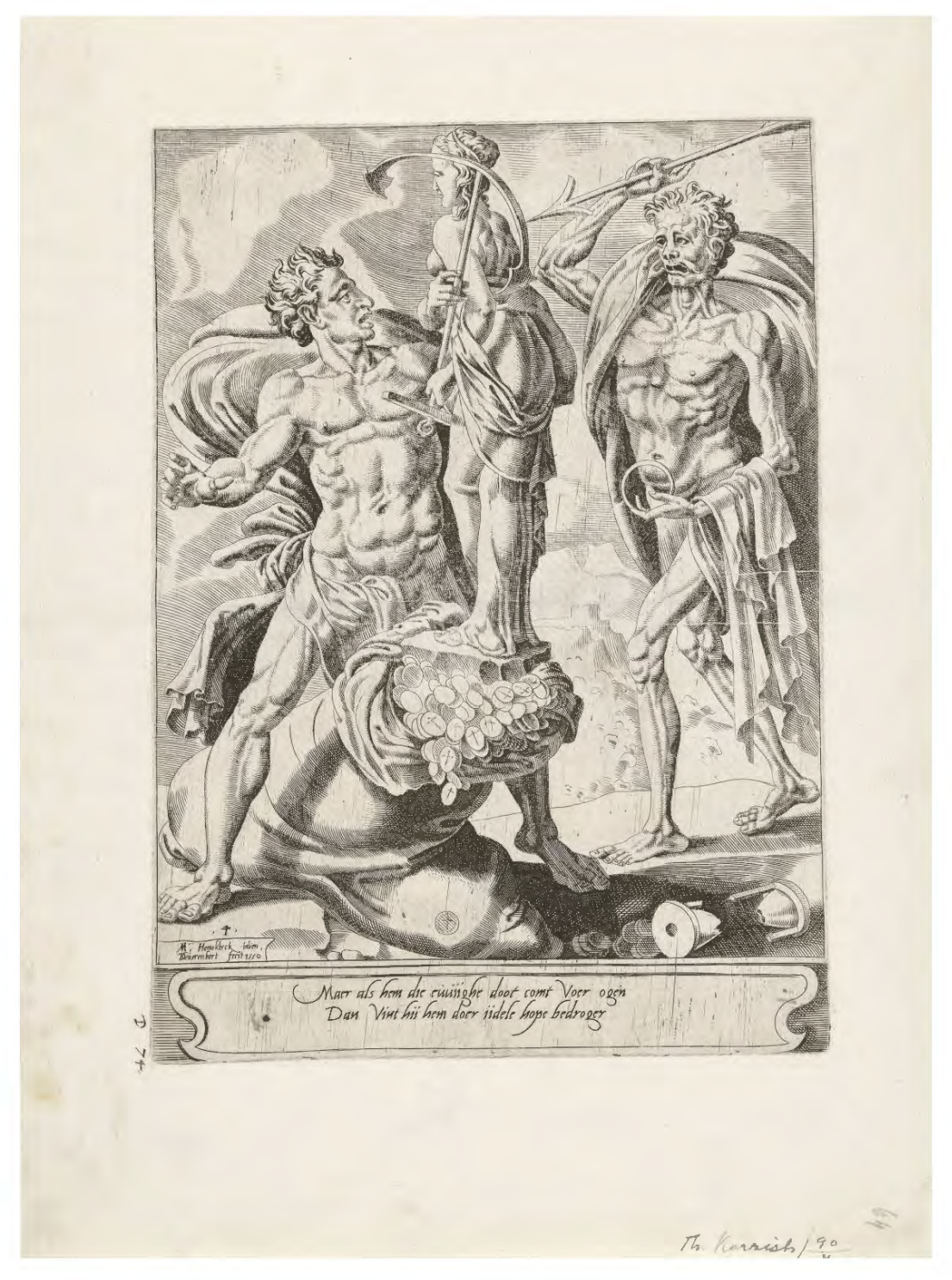
Figure 4: Dirck Coornhert & Maarten van Heemskerck, Money is of no Avail in the Sight of Death , 1550, engraving, Amsterdam, Rijksmuseum