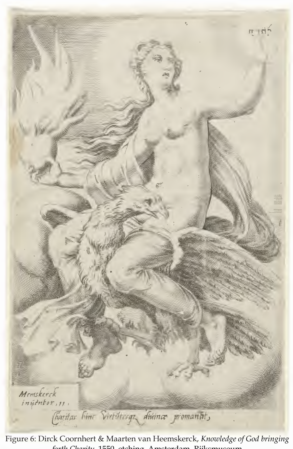
Figure 6: Dirck Coornhert & Maarten van Heemskerck, Knowledge of God bringing forth Charity, 1550, etching, Amsterdam, Rijksmuseum