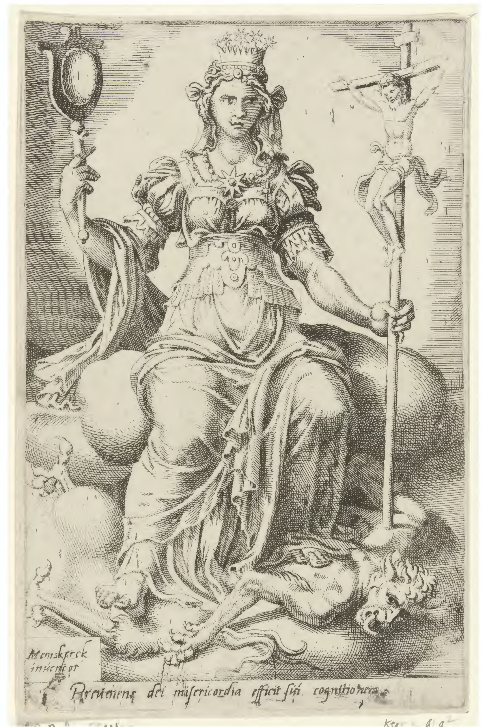
Figure 8: Dirck Coornhert & Maarten van Heemskerck, God's Pre-Existing Mercy Engenders Self-Knowledge , 1550, etching, Amsterdam, Rijksmueum