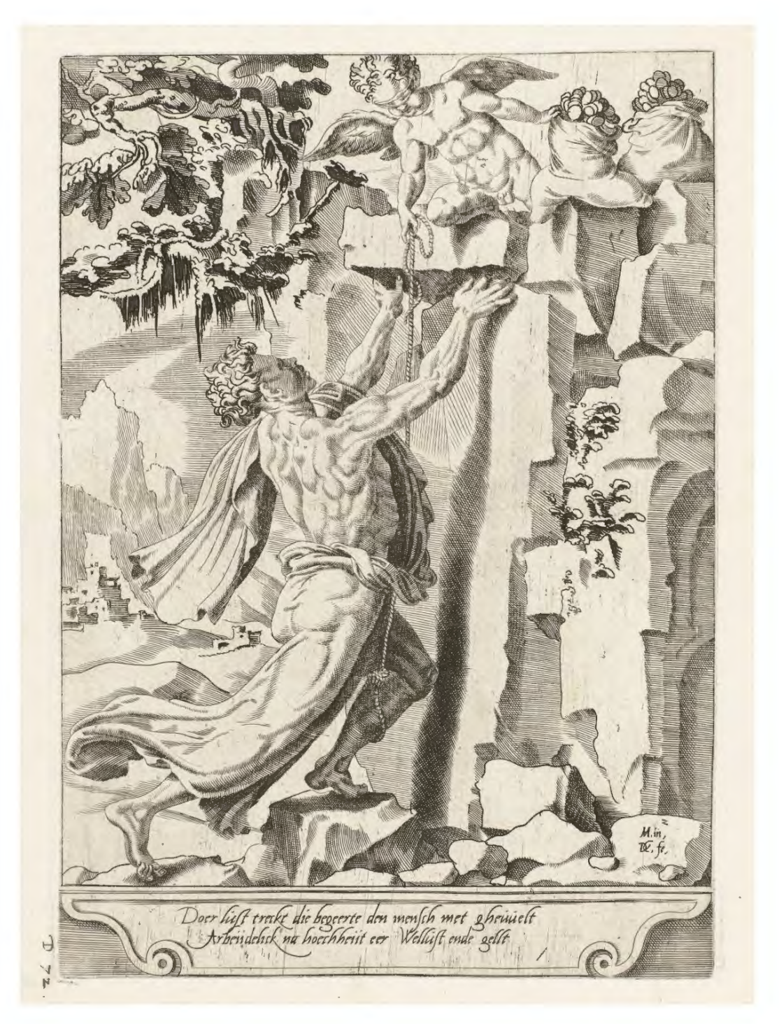
Figure 2: Dirck Coornhert & Maarten van Heemskerck, Desire Tempting Man with Money , 1550, engraving, Amsterdam, Rijksmuseum