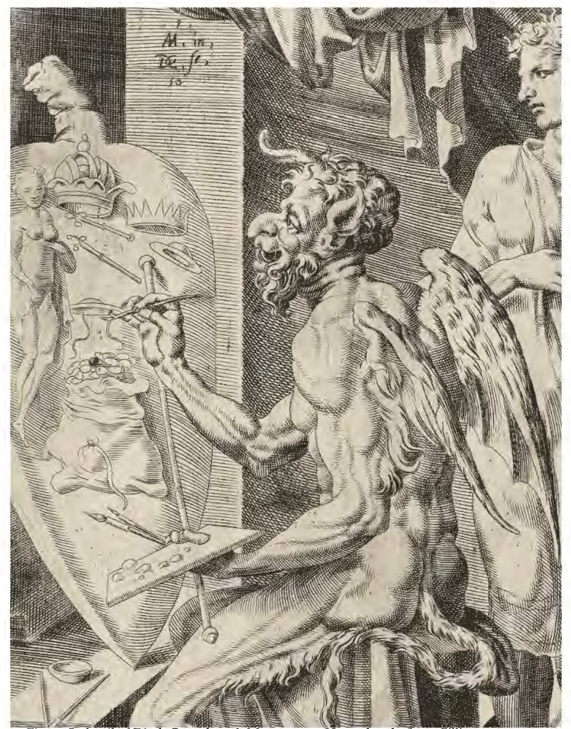
Figure 5: detail of Dirck Coornhert & Maarten van Heemskerck, Satan Filling Man's Heart with Worldly Things , 1550, engraving, Amsterdam, Rijksmuseum