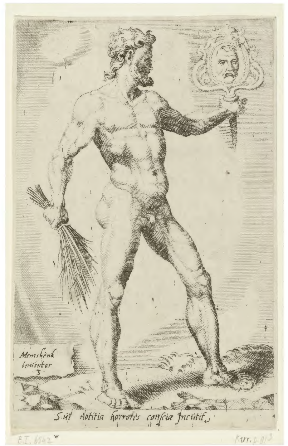
Figure 9: Dirck Coornhert & Maarten van Heemskerck, Self-Knowledge Inspires the Conscience with Abhorrence, 1550, etching, Amsterdam, Rijksmeseum