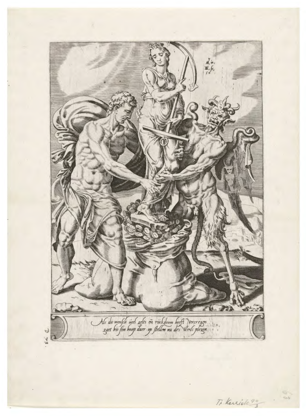
Figure 3: Dirck Coornhert & Maarten van Heemskerck, Man Placing Hope on Money , 1550, engraving, Amsterdam, Rijksmuseum