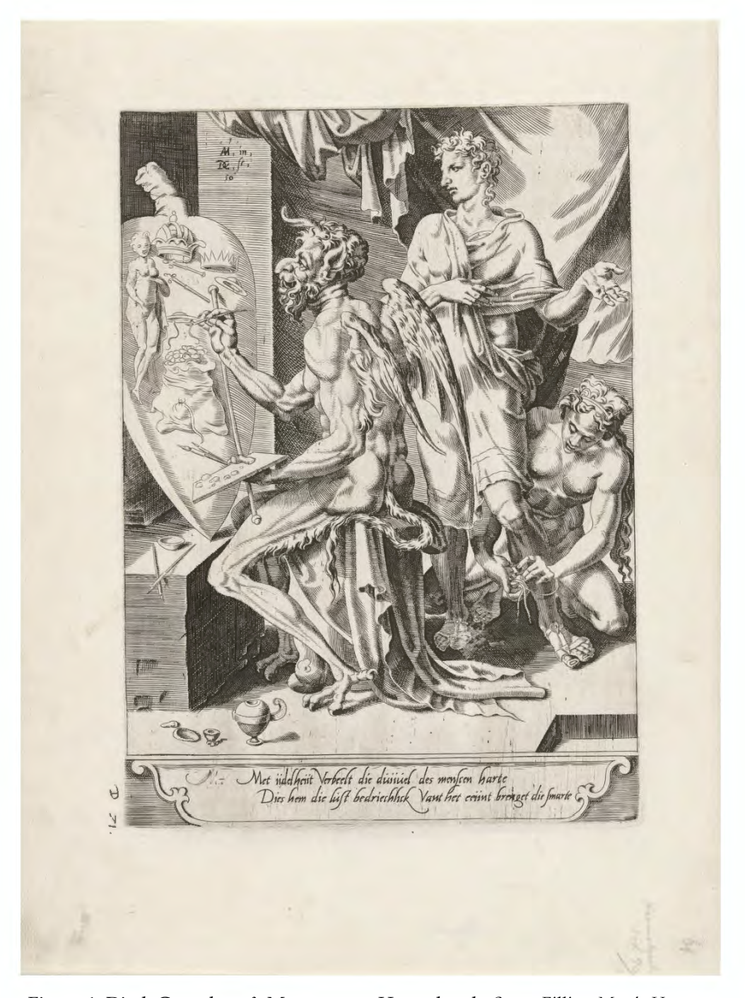
Figure 1: Dirck Coornhert & Maarten van Heemskerck, Satan Filling Man's Heart with Worldly Things , 1550, engraving, Amsterdam, Rijksmuseum