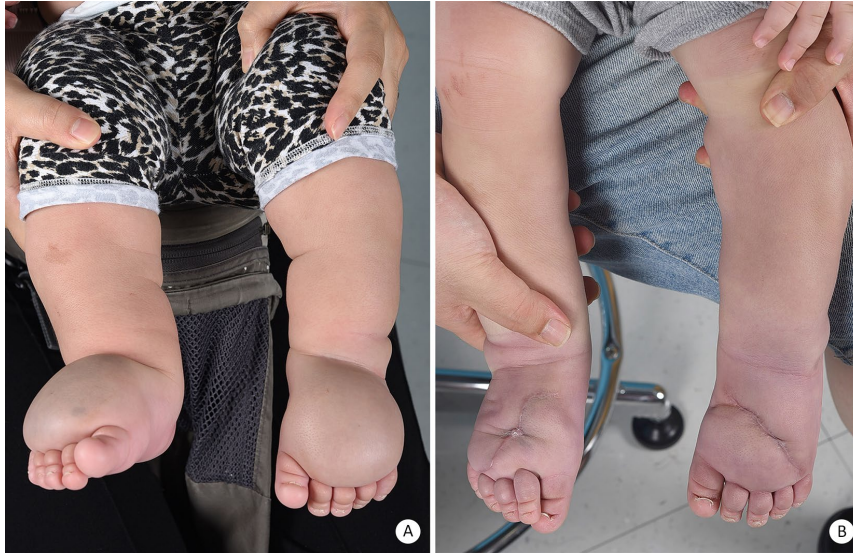
Fig. 2. (A) Bilateral swelling of the calves and dorsum of the feet seven months after birth of the male infant, before debulking surgery. (B) Bilateral calf and dorsum of the feet after debulking surgery at 11 months of age.

his feet; therefore, he required surgery. Magnetic resonance imaging of the lower extremities was performed in preparation of the surgery. Consequently, congenital lymphedema was suggested based on the probable bilateral diffuse soft tissue edema and predominant vascular structure with mild enhancement involving the subcutaneous fat layer of the dorsum of the feet and lower legs (right > left). Debulking of bilateral dorsum of the feet was performed when he was 11 months-old, and after surgery, conservative treatment with a compression bandage was maintained ( Fig. 2 ).