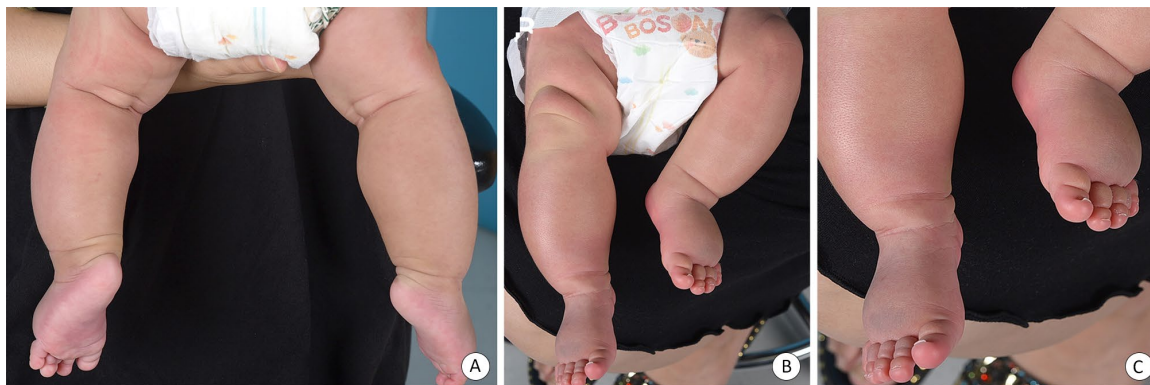
Fig. 1. (A) Bilateral swelling of the calves of the female infant one month after birth, swelling of the right (Rt) calf is more prominent than that of the left (Lt) calf. (B) Bilateral swelling of the dorsum of the feet one month after birth, Lt. dorsum of the foot swelling is more prominent than that of the Rt. dorsum of the foot. (C) Upslanting toenails observed in both big toes.

been several case reports in which individuals presenting with no symptoms were parents to some of offspring diagnosed with Milroy disease (7,11). With no evidence of autosomal recessive inheritance or spontaneous mutation, these reports suggest incomplete penetrance of Milroy disease inheritance, indicating that approximately 10-15% of individuals with an FLT4 pathogenic variant could be clinically asymptomatic (6). However, to our knowledge, no previous studies have reported a case where all offspring from phenotypically normal parents were affected by Milroy disease.