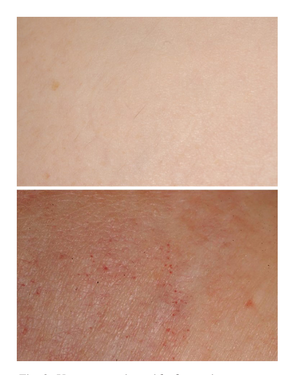
Fig. 2. Vacuum suction with the angiosterrometer was unable to induce petechia formation on the right thigh of a 46-year old obese woman (Top) compared to numerous induced petechiae on the left thigh of a 56-year old woman with lipedema (Bottom).

In lipedema, the pathological fat deposit, distribution and peculiar enlargement of subcutaneous fat is presumably linked with microangiopathy and altered microcirculation leading to increased permeability and proteinrich fluid extravasation, which further enhances the amount of lymph formed.