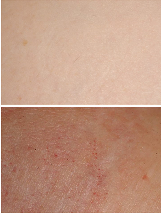
Fig. 2. Vacuum suction with the angiosterrrometer was unable to induce petechia formation on the right thigh of a 46-year old obese woman (Top) compared to numerous induced petechiae on the left thigh of a 56-year old woman with lipedema (Bottom).

In lipedema, the pathological fat deposit, distribution and peculiar enlargement of subcutaneous fat is presumably linked with microangiopathy and altered microcirculation leading to increased permeability and protein-rich fluid extravasation, which further enhances the amount of lymph formed.