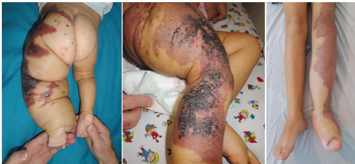
Fig. 1. CLOVES Syndrome in a baby displaying lipomatous overgrowth, hypertrophy, vascular nevi, and vascular malformation without lymphedema (left). Klippel Trenaunay Syndrome in a young child demonstrating hypertrophy and vascular nevi (center). This patient was selected to undergo treatment using the proposed Palma-Olszewski technique. Klippel Trenaunay Syndrome in an older child three years post-operation using the Palma-Olszewski Technique (right).

A complicating problem is fibrosis at the level of the anastomosis, which is a common issue with all techniques. As this technique is performed with a terminal vein that has a good caliber, the suture involves the area around the lymph node and the entire venous wall to ensure closure as well as to inhibit the development of fibrosis. In addition, because thrombosis is possible at a lympho-venous or nodal-venous anastomosis, local endovenous heparin is mandatory to inhibit clot formation.