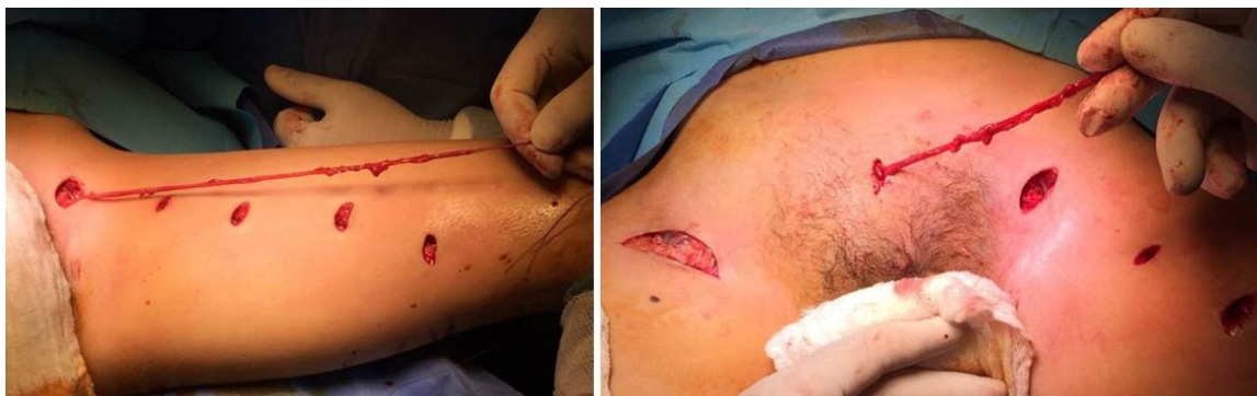
Fig. 3. The Palma technique includes the dissection and collection of a vena saphena magna in a 5-step procedure (left) and then the suprapubic, subcutaneous translocation of the vein connecting to the opposite side to reduce venous pressure (right).