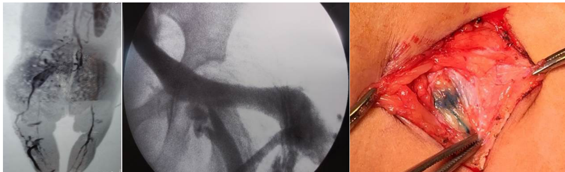
Fig. 2. Imaging options for patients include: (left) Angio Magnetic Resonance with contrast, as seen here in the venous sequence of a baby with Klippel Trenaunay Syndrome and Lipomatous Overgrowth demonstrating truncular and extratruncular venous-lymphatic malformation on the legs and pelvis; (center) Phlebography via the saphena externa on a lower limb demonstrating persistent vena marginalis, and hypoplasia of the superficial femoral vein with avaluatation in this patient with Klippel Trenaunay Syndrome; and (right) Lymphochromy in a lower limb following dissection to identify a sentinel lymph node and vessel as the first step for a lymphovenous shunt with the Palma-Olszewski alternative.

with ^{99m}\text{Tc} , if necessary for a dynamic evaluation.