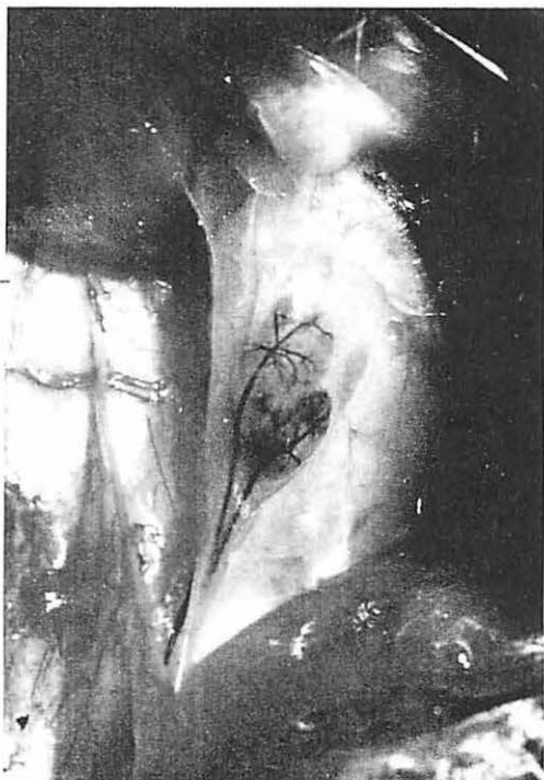
Fig. 1 Macroscopic view of the popliteal node in the rabbit, immediately after the injection of 4 % Patent Blue dye into an afferent lymphatic.

Fig. 2 Further continuous perfusion with Patent Blue dye (1,0 ml.) resulted in filling up two oval-shaped areas, according to the supplying field of the afferent cannulated.