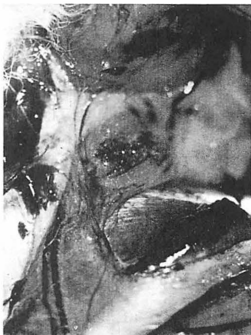
Fig. 3 The translymphatic perfusion with Chlorophyll-stained oiled contrast medium (Lipiodol Ultrafluid) delineated first also two "lobules" supplied from the afferent lymphatic which had been cannulated. Two tortuous efferent vessels became also visible.

The removed lymph nodes showed a rather strict compartmentalization, according to to supplying area of the afferent lymphatic stained intensively green and a faintly stained part, delineated only later. The roentgenograms corresponded well to the macroscopic observation showing a more intensive filling in the lymph node part which had been perfused by the afferent lymphatic. As to the autoradiographic studies, labelled cells have been seen only in the cortical region of a limited area mentioned above and marked by a distinct furrow after perfusion with Patent-Blue dye. However, this delimitation was far not so unambiguous in the medullary area in contrast to the cortical area, where labelled cells were only sparsely encountered in the neighbouring cortical part of the nodes beyond the "furrow" seen macroscopically (Fig. 7). The compartmentalization of the cortex was