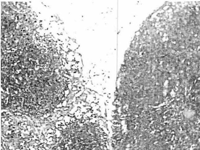
Fig. 7 Compartmentalization of the cortex as seen by autoradiography ( ^3\text{H} -thymidine). Labelled cells were mainly seen in follicles of a delimited segment supplied by the afferent vessel which had been used for perfusion.