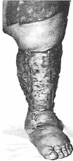
Fig. 4. The leg shown in Fig. 3, 6 months after treatment by a Charles' operation as modified by the author. In addition the antigravitational ligatures had been carried out.