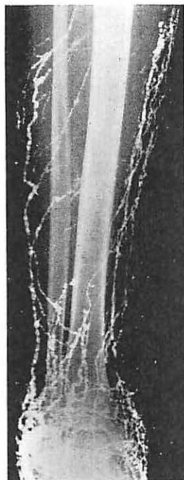
Fig. 1. Demonstration of gravitational reflux obtained by lowering the leg.

It is unlikely that peripheral lymphedema develops on the basis of a single mechanism common to all patients. For this reason attempts to apply a uniform surgical approach to this trying problem has failed. While operations based on excision of affected tissues, anastomosis between the lymphatic and venous systems or between normal and abnormal portions of the lymphatic system each have their advocates, it is clear that advances in therapy must await clarification of the precise derangement in each patient. In this regard, a personal 18 year experience with more than 300 patients including 80 who underwent operation, suggests that insufficient attention has been directed to gravitational factors in the pathogenesis of this disorder. Stasis resulting from a non-moving column of lymph in dilated lymphatic with valvular insufficiency may be an important component of the disorder in some patients. Attempts to correct this by ligation of the incompetent vessels in such patients seem justified and may establish flow in normal collateral channels sufficient to relieve the problem (1-5).