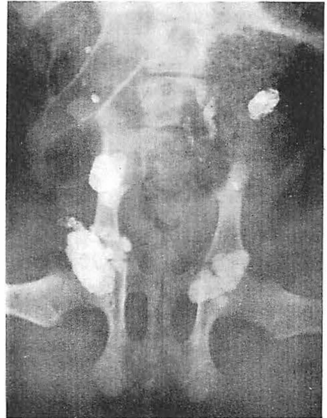
Fig. 4. Lymphadenogram taken 3 days after the lymphangiogram shown in Fig. 2, i.e. 9 weeks after formation of iliac arterio-venous fistula (same animal). Again, there is no significant difference between Figs. 3 and 4.