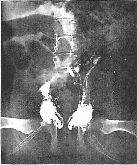
Fig. 1. Lymphangiogram before operation, showing normal anatomical arrangement of lymph vessels and nodes (animal No. 5)