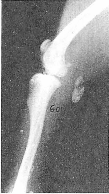
Fig. 3: Lymphadenogram of the popliteal lymph node taken 24 hours after injection of Lipiodol UF into the bone marrow cavity of the tibia.