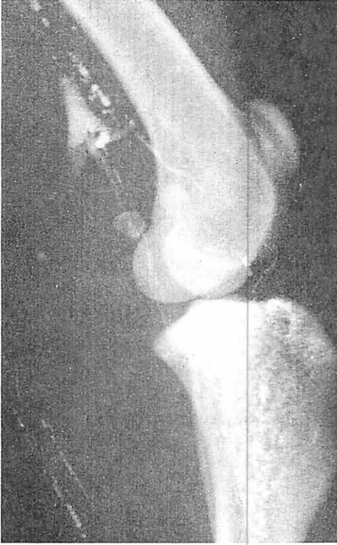
Fig. 1: Lymphangiogram of vessels draining the proximal epiphysis of the tibia of the dog taken 5 minutes after injection of 5 ml of Lipiodol UF into the distal epiphysis. Oily contrast medium in the trabecular matrix of the bone. Note lymphatics leaving the bone at the level of knee joint, probably running in the joint capsule, then joining larger thigh lymphatics. In the upper part some of the contrast medium in the vein outlining its valve.