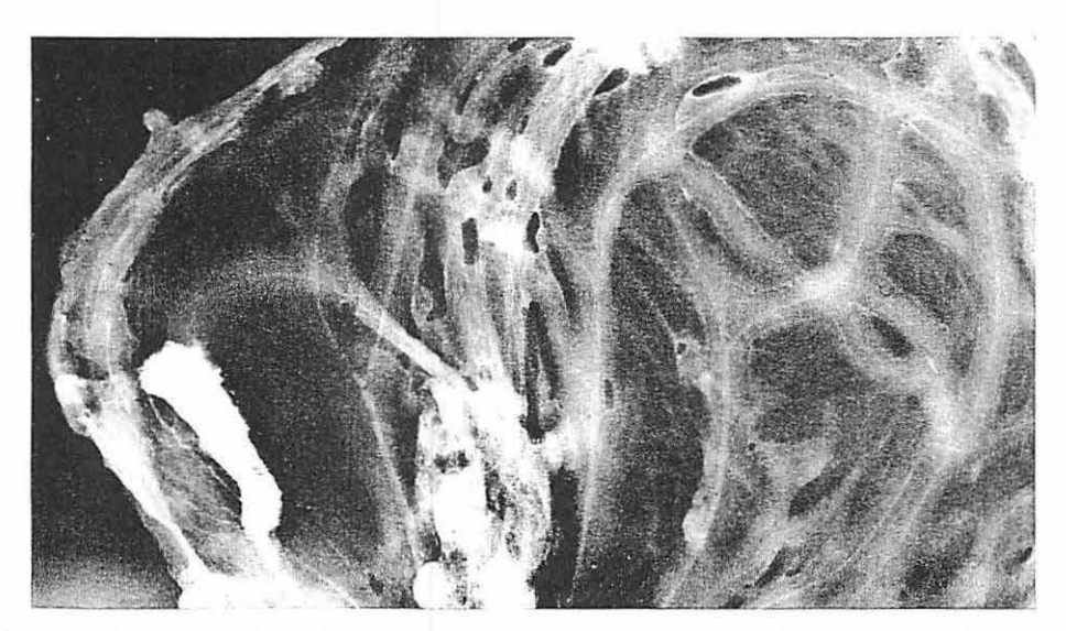
Fig. 10 Radiogram of stretched omentum with depots of Thorotrast in the tissue. A few very fine lymphatics, especially on the left and in the centre of the picture, are filled with contrast medium. Veins can also be seen running centrally in the trabeculae. The arcade-like architecture of the trabeculae and their communicating blood vessels can clearly be seen.

In radiograms of the spread-out omentum the trabeculae appear as a system of multiple communicating arcades (Fig. 10). After interstitial injection of Thorotrast, in most cases only a few fine-bore lymphatics were filled in the immediate vicinity of the injection spot. The filling was best during the first hour after the injection. In radiograms taken 1–14 days after the injection the contrast depots were gradually loosened up, their outlines becoming spiny and unsharp, but no lymphatics were visible. No lymph nodes filled with the contrast medium could be seen.