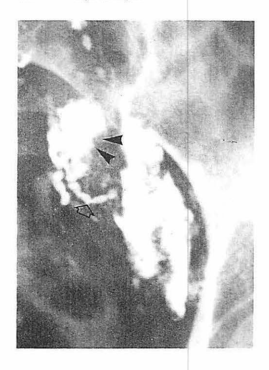
Fig. 2, Case I A 24 hour follow-up (nodal phase) lymphogram reveals marginal filling defects in a left pelvic lymph node (back arrowheads). A circumventing lymphatic channel (open arrow) indicates tumor replacement of lymph node causing obstruction.

tional type. The positive lymph node seen on lymphangiogram in the pelvis on the left side and another adjacent and distal lymph node were the only two lymph nodes out of 14 removed from the pelvis which contained tumor. The second positive lymph node found in the pelvic section was seen in the lymphangiogram indirectly as circumvented efferent lymph channels because of tumor obstruction of the lymph node. This finding correlated well with the pathologic specimen. Dissection of the inguinal lymph nodes was not performed in this patient at this time.