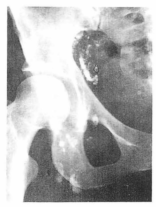
Fig. 4 Case III. A 24 hour follow-up lymphogram revealed marginal filling defects in pelvic lymph nodes (arrows) on the left side. (a) an antero-posterior view (b) a right posterior oblique view.