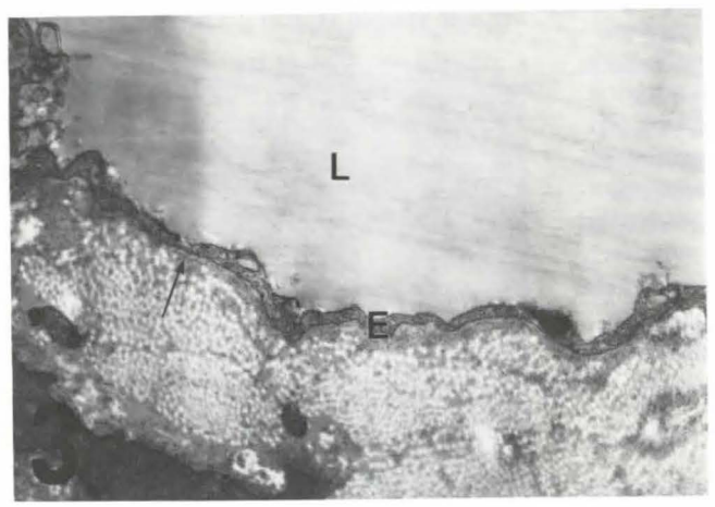
Fig. 3 The lymphatic fixed in glutaraldehyde and osmium, embedded in Epon and stained with uranyl acetate and lead as usual. The continous basal lamina (\Lambda) is observed. x 18 000

some of the membranes are only weakly stained (Fig. 2). There is no difference in findings in specimens stained for 60 minutes and those for 120 minutes. Another control stained without silver has proved no positive staining at all. The usual electron microscopic examinations staining the sections by uranyl acetate and lead citrate after postosmification of the tissue have revealed a never interrupted basal lamina of the lymphatic endothelial cell (Fig. 3).