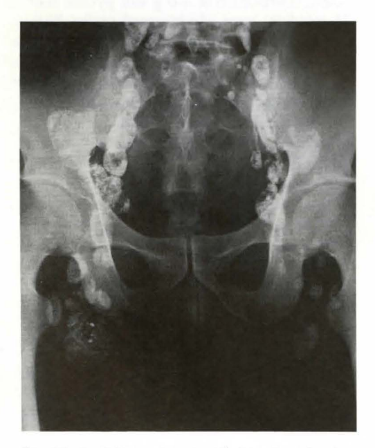
Fig. 1A, B Pelvic and paraaortic lymph nodes are enlarged and have granular and lace-like patterns