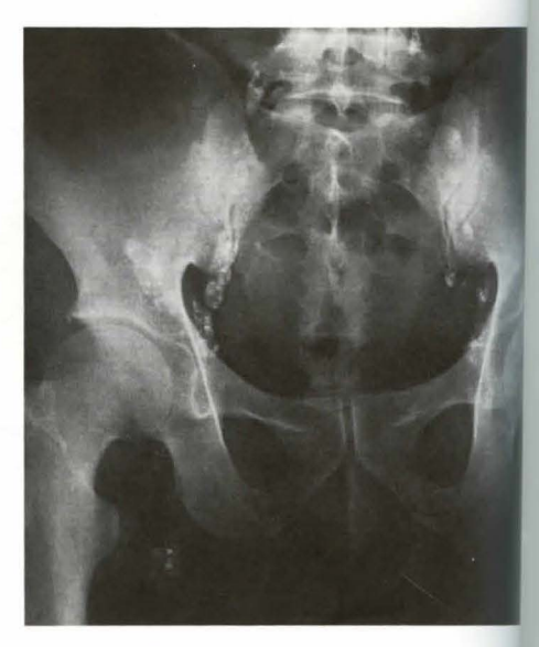
Fig. 2A, B The lymph nodes had decreased mark ly in size during a 3-months period