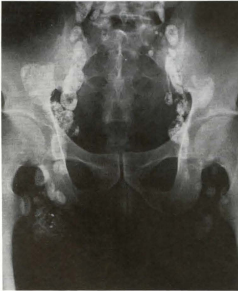
Fig. 1A, B Pelvic and paraaortic lymph nodes are enlarged and have granular and lace-like patterns