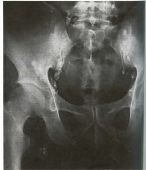
Fig. 2A, B The lymph nodes had decreased markedly in size during a 3-months period