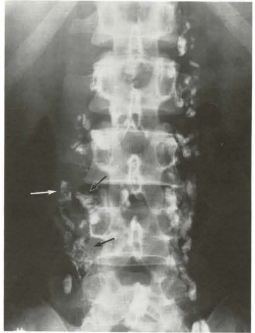
Fig. 2 Case 2, Lymphogram, anteroposterio view Paraaortic lymph nodes are slightly enlarged, with foamy internal structures and filling defects (arrows)

surgeon in obtaining the most abnormal-appearing lymph nodes for biopsy. In conclusion, among our 25 patients who received lymphography in evaluation of F.U.O., lymphography added nothing in 21 and very little in 4 regarding the patients' management and final diagnoses. Therefore, we agree with Dunnick and Castellino (14), that lymphography is not absolutely indicated in the evaluation of F.U.O..