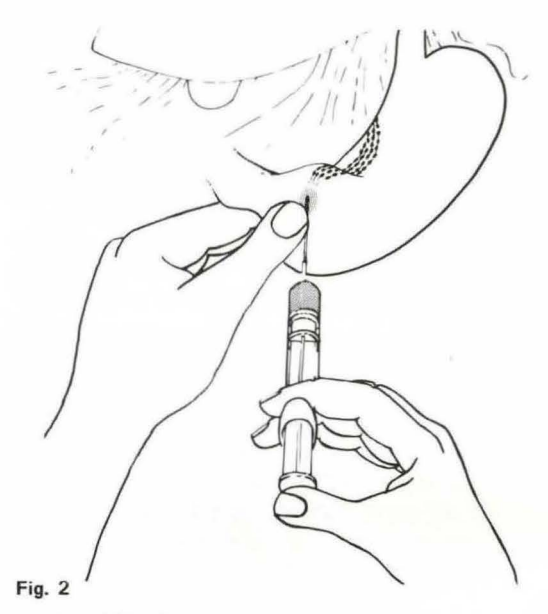
Fig. 1 and Fig. 2 The lymphatic injection on the stomach

The thumb, ahead, obliterates efficiently the point of penetration of the needle. It stops the backflow of the solution which tends to be driven back by counterpressure of the forefinger.