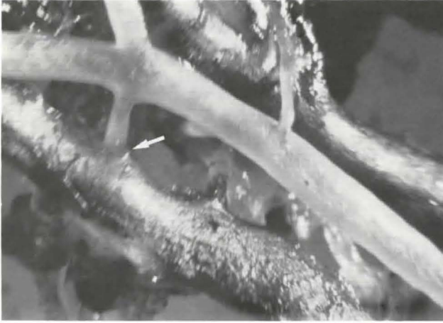
Fig. 3 Development of the arteriovenous shunt in the heart in lymphatic cardiomyopathy as seen in a PVC corrosion preparation. PVC corrosion preparation made of a dog's heart after ligation of the main lymph trunks and regional lymph nodes of the heart. There is an arteriovenous shunt and arteriovenous anastomosis marked by ↓. Yellowish-white stain was added to 5% PVC solution instilled into the arterial branch and greenish-yellow stain in the case of the venous branch.

only histological, but also structural changes and disturbance of the function of the heart can result from cardiac lymphoedema (Ullal et al. 1972). It is worthy of note that endothelial swelling, subendothelial plasma imbibition and fibrinoid necroses of the vessel wall may develop in the small coronary branches in consequence of cardiac lymphostasis (Solti et al. 1968). Oddly enough, the effect of the cardiac lymphostasis on the coronary circulation and cardiac microcirculation has not yet been studied. Eliska and Eliskova (1975) observed the development of lympho-lymphatic and lymphovenous anastomoses in mechanical insufficiency of the cardiac lymph circulation.