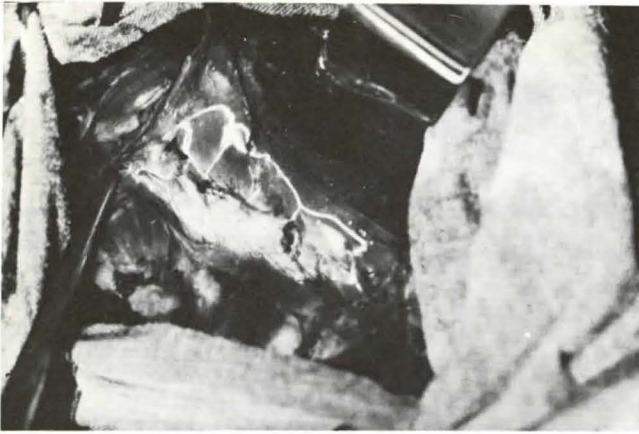
Fig. 1 Wood's light associated with artificial light. Visualization of lymphatic drainage from thyroid gland in the dog by intraparenchymal injection of "4-4'SDS"