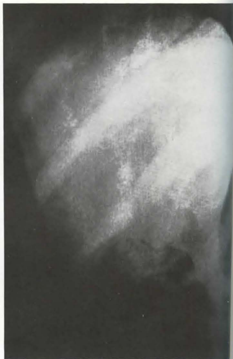
Fig. 3a and 3b Modification in the appearance of a hepatic oil embolism in a patient over a 24 hour interval.