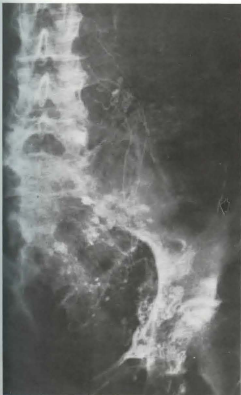
Fig. 1 Malignant lymphoma: opacification of the sigmoid wall (arrow) in relation with left iliac adenopathies diagnosed by ultrasound