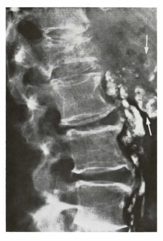
Fig. 3 Lateral view of case 5 reveals destruction and compression fracture of LI vertebra. The lymph nodes are displaced and the largest nodes contain filling defects, indicating involvement with myeloma (arrows)

case 2 a routine chest X-ray also revealed enlarged hilar nodes. In case 5, close to the pathologic nodes, the body of the first lumbar vertebra contained an osteolytic myeloma lesion (Fig. 3). On therapeutic irradiation of the vertebra all the affected nodes were incorporated in the same treatment field. In a control picture taken after the irradiation the pathologic nodes were smaller.