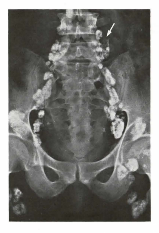
Fig. 2 Case 10: Two large nodes in left lower lumbar region show irregular filling defects and broken margins indicating myelomatous involvement (arrow). The rest of the nodes are slightly enlarged and demonstrate a coarse pattern representing a reactive hyperplasia