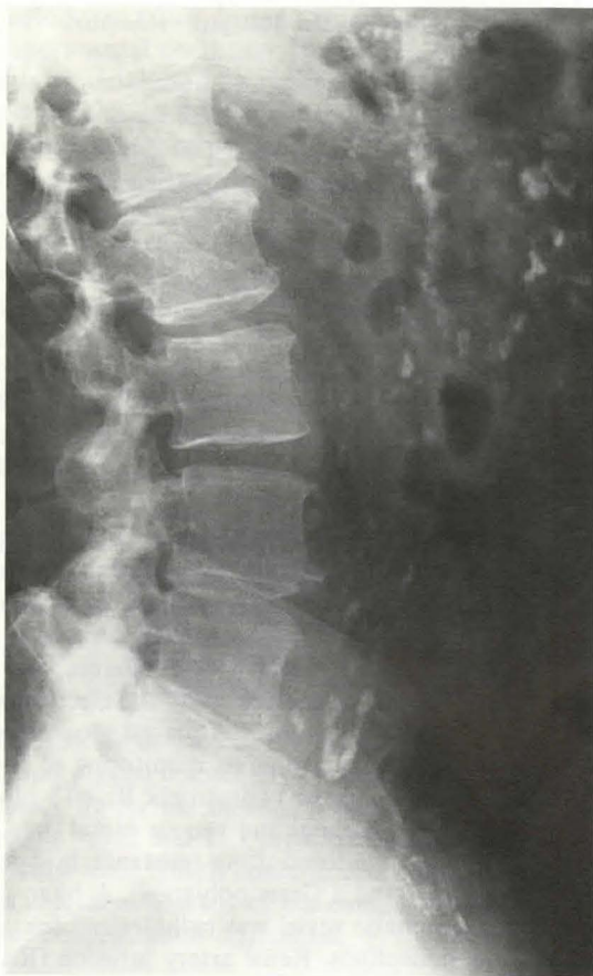
Fig. 2 Same as Fig. 1 shown in the lateral view