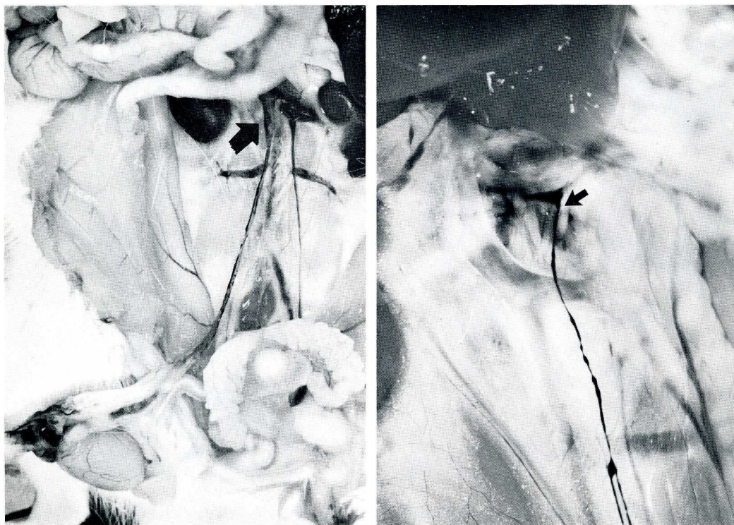
Fig. 1: a) A collecting testicular lymph trunk bypassing retroperitoneal lymph nodes and draining directly into the cysterna chyli (arrow). b) Higher power view (arrow) where the testicular collecting lymph trunk opens directly into the fluctuant cysterna chyli. This sac must be distinguished from renal hemolymph nodes that lie nearby.