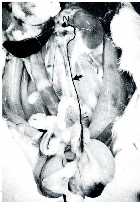
Fig. 2: A testicular collecting lymph trunk (arrow) drains cephalad and enters a renal hemolymph node (N).