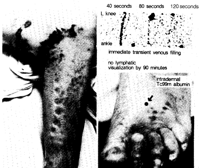
Fig. 2. Right leg, left foot, and lymphoscintigram (upper right) in classical Kaposi's sarcoma. In this 74-year-old man with longstanding Kaposi's sarcoma of the lower extremities treated with irradiation and displaying extensive brawny edema (note linear pitting) and ulceration, intradermal deposition of 500 \mu c of ^{99m} Tc albumin in the dorsum of the left foot resulted in prompt visualization of the draining venous system several seconds after injection and fading by one minute. This finding is consistent with a lymphatic venous shunt or direct communication of the interstitium with an abnormally permeable venous system.

Thus, the constellation of clinical and pathologic findings in AIDS (i.e., the HIV-induced disease)--immunosuppression associated with T-helper lymphocyte and lymphoid tissue depletion, fibrosis, opportunistic infection, and aggressive vascular malignancies--reproduces systemically and in macrocosm the sequelae of lymphostasis in the affected lymphedematous part. In peripheral lymphedema, the findings are limited to the involved extremity ("local AIDS") but a more generalized immunodeficiency state (a form of "systemic AIDS") develops without HIV in congenital and acquired visceral lymphangiectasia syndromes associated with chylous reflux, protein-losing enteropathy, or other external and internal bulk losses of lymph and its constituent lymphocytes, where especially the afferent limb of the immune response becomes impaired (8).