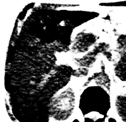
Fig. 3. Abdominal computed tomography 10 days after lymphogram demonstrating persistence of contrast medium in the liver.

suggests a lymph-umbilical communication via parietal lymphatic trunks rather than collateral visceral lymphatic plexuses.