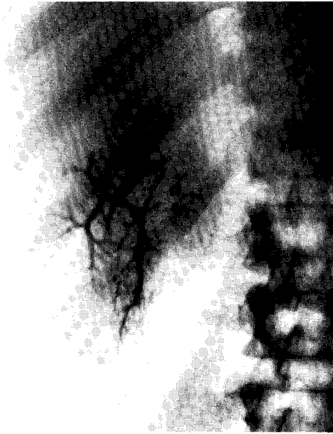
Fig. 2. Plain x-ray of the abdomen showing oil embolization in the portal venous radicles of the left lobe.