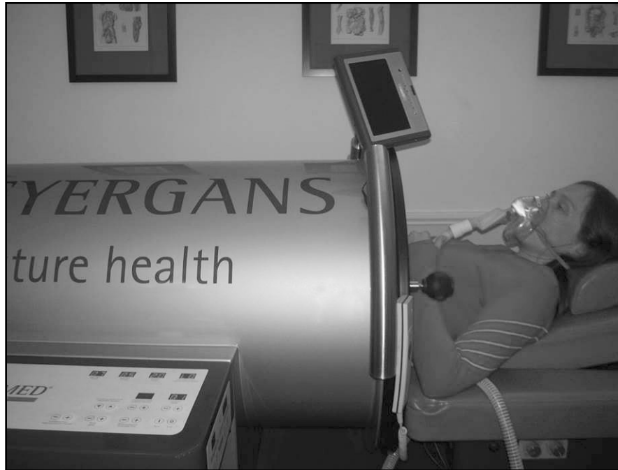
Fig. 1. Patient positioned in the intermittent negative therapy pressure device (Vacumed, Weyergans) used as part of the CLyFT lymphedema treatment protocol.

In addition, the alternating pressure of the intermittent negative pressure system leads to accelerated lymphatic flow and increased micro-perfusion in the peripheral venous system (6). Montgomery et al investigated blood flow in lymphedematous and non-lymphedematous arms (16). They found altered arterial and venous properties in the lymphedematous limbs, lower venous tone, lower venous return, and increased arterial blood flow into the lymphedematous limb. It is possible that the intermittent negative pressure device would have a beneficial effect on the venous and arterial flow and also excess volume in patients with lymphedema, where an overload on the venous system contributes to excess fluid in the affected limb (17).