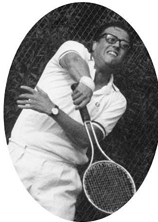
Fig. 2. Winning the Golden Lymph Node Trophy at the 1 st ICL.