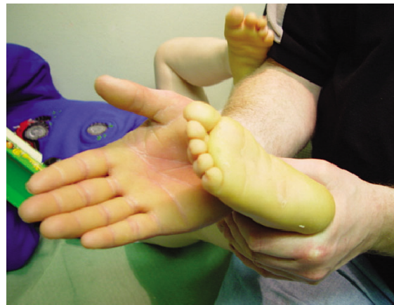
Fig. 2. A – Right lower limb lymphedema in a 30-month old child. B – Yellow soles of feet in 30-month old child, and yellow palm in father.