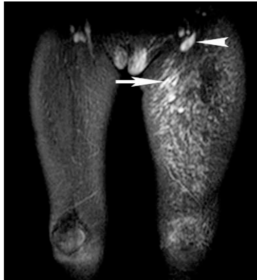
Fig. 4: Coronal T2-weighted image revealed prominent subcutaneous lymphatics (arrow) in the left lower extremity and enlargement of inguinal lymph nodes (arrowhead).

children to swallow the wireless capsule. Therefore, a simpler and more efficient diagnostic tool remains to be identified.