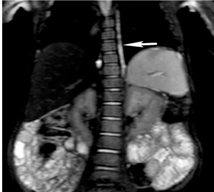
Fig. 3: Coronal T2-weighted images of an extremely dilatated thoracic duct (arrow) with a diameter of 5 mm.