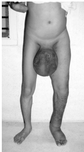
Fig. 3. Post left nodo-venous shunt with 50% reduction in leg edema (1998).