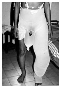
Fig. 1. Preoperative photograph with custom support (1998).

A young man of 21 years presented in 1998 with progressive leg and scrotal swelling despite custom-made support and treatment in several hospitals (Figs.1,2). His parents related a history of swelling of the left leg since birth, and diarrhea with recurrent attacks of fever and swelling of the scrotum for the past 10 years. There was no family history of lymphedema. A lower extremity