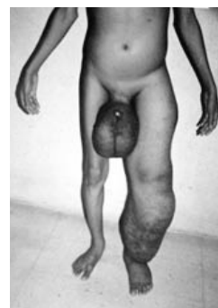
Fig. 2. Same as Fig. 1, without custom support (1998).

lymphangioscintigram showed normal transport on the right side and no transport on the left from the foot injection site. Blood was negative for microfilaria. He was diagnosed with PLE from lymphangiectasia after intestinal biopsy showed intestinal lymphangiectasia and was instructed to avoid long chain triglycerides and use a medium chain triglyceride diet with added proteins. His diarrhea subsequently improved.