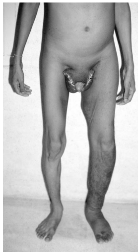
Fig. 4. Post-scrotal excision and sac excision and eversion (1999).