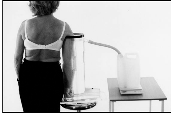
Fig. 1. Arm volume measurement with water displacement method.

The lymphedema absolute volume (LAV) was obtained by calculating the difference in volume between the lymphedema arm and the contralateral arm (37,38). The lymphedema relative volume (LRV), taking build into account, was defined as an increase in volume of at least 10% compared to the non-operated arm (33) using the following formula: