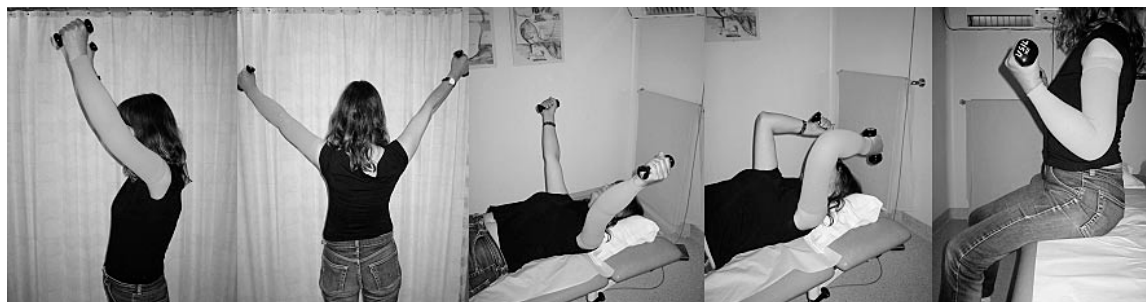
Fig. 2. Exercise program with weights including shoulder flexion, abduction and horizontal adduction together with elbow extension and flexion.

the patient standing, with arms hanging, on a 100 mm horizontal visual analogue scale (VAS). The endpoints were “no discomfort” (0 mm) and “worst imaginable” (100 mm) (45). The initial scores before exercise sessions were made available to the patient for scoring after the sessions (46).