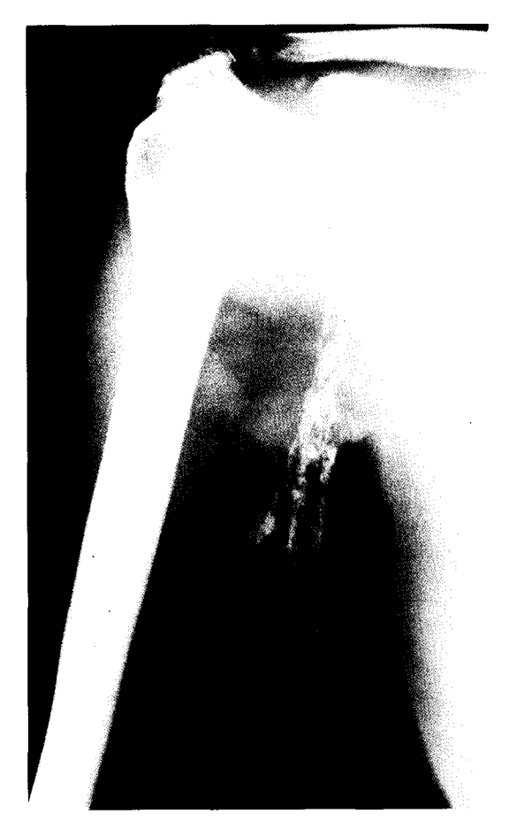
Fig. 3. Conventional lymphography demonstrating lymphatics within the sheath of the axillary vein.

(2) but seeding does not necessarily mean clinical infection. Many humans may inhale tubercle bacilli but only a small number will get clinical tuberculosis. On the other hand, if susceptible, humans infected with smallpox virus almost all will clinically fall ill. Overt infection needs a "suitable" medium, "dead space," and "fluid accumulation," which in the case of axillary dissection must be prevented.