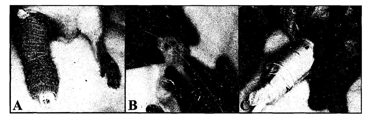
Fig. 1. Photographs illustrating techniques of A) Compression Bandaging using a soft under layer of Conform and a low stretch outer layer of Coban, B) Manual Lymph Drainage of the jugular region, C) Pneumatic Compression Pumping using a size one neonatal blood pressure cuff over the foot and ankle and a size 2 cuff as a second layer that continues up to the mid-thigh over a layer of Conform.

We previously refined an inexpensive, reproducible rodent model of peripheral lymphedema, which simulates secondary lymphedema as seen in patients (1,5) This hindlimb preparation consists of radical lymphatic/nodal groin excision combined with regional irradiation. In the current study, we miniaturized and standardized physical treatment modalities advocated for peripheral lymphedema. These included manual lymphatic drainage (decongestion), low-stretch multilayered compressive bandaging alone or together with massage as "combined physiotherapy," and a pneumatic compression pumping group. The effectiveness of each treatment modality was quantified and compared with each other and a no treatment or control group.