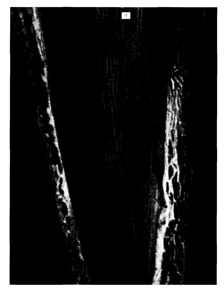
Fig. 2. Artificial interstitial subcutaneous edema induced by infusion of a crystalloid solution into an amputated leg. Note that the MR image (T2weighted sequence) shows a trabecular pattern throughout the subcutaneous tissue similar to that in Fig. 1. Histologically, no dilated lymphatics were seen.

There has been disagreement on the interpretation of these subcutaneous trabecular structures as they seem to contain fluid. Hadjis et al (6) concluded that they were fluid density but Case et al (6) and Fujii (5) considered them to be dilated collateral lymph vessels. To resolve this issue, we undertook a combined MRI and pathologicalanatomical study. In a freshly amputated leg of a 74-year old man, we produced artificial skin edema. Using a method of Kubik (personal communication), a catheter was introduced into the femoral artery. After rinsing the leg with 20% sodium acetate solution, the blood vessels were filled by a means of an infusion pump with a 2.5%