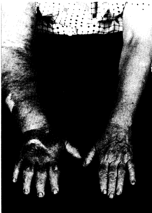
Fig. 1. 72-year-old woman with angiosarcoma of the right arm which developed in a chronically lymphedematous extremity related to childhood trauma. Numerous plaques (dark blue) are visible.