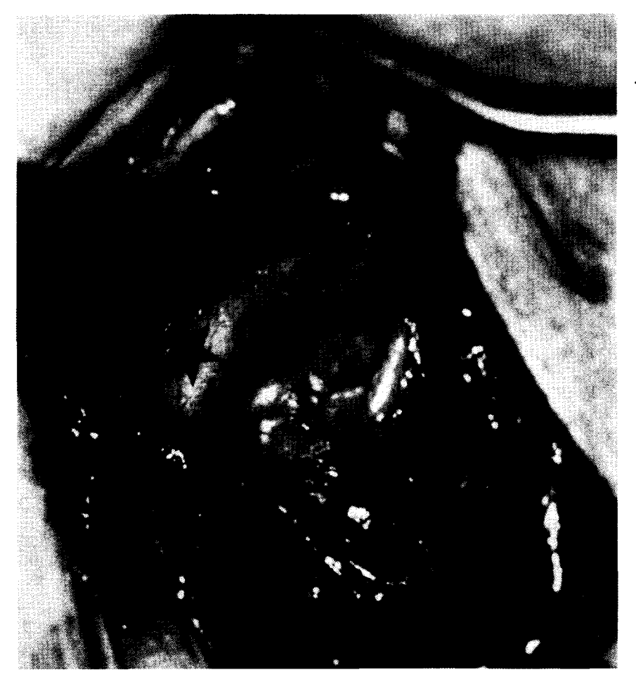
Fig. 1. Lymphangiectasia (arrow) posterior and lateral to the internal jugular vein (star). Ectatic lymph vessels were removed with the surrounding fatty and connective tissue via a horizontal supraclavicular incision following the relaxed skin tension lines (case 1). The thoracic duct was sutured behind the clavicle.

normal configuration of the supraclavicular region. At operation, the fatty and connective tissue near the junction of the thoracic duct with the internal jugular vein was characterized by ectatic lymphatic vessels over an area of 5 x 3 cm ( Fig. 1 ). The abnormal tissue was adherent to the deep cervical fascia and extended to the midline behind the internal jugular vein inferiorly to the lung apex. A complete excision was performed and the thoracic duct was ligated behind the clavicle to prevent lymphorrhea.