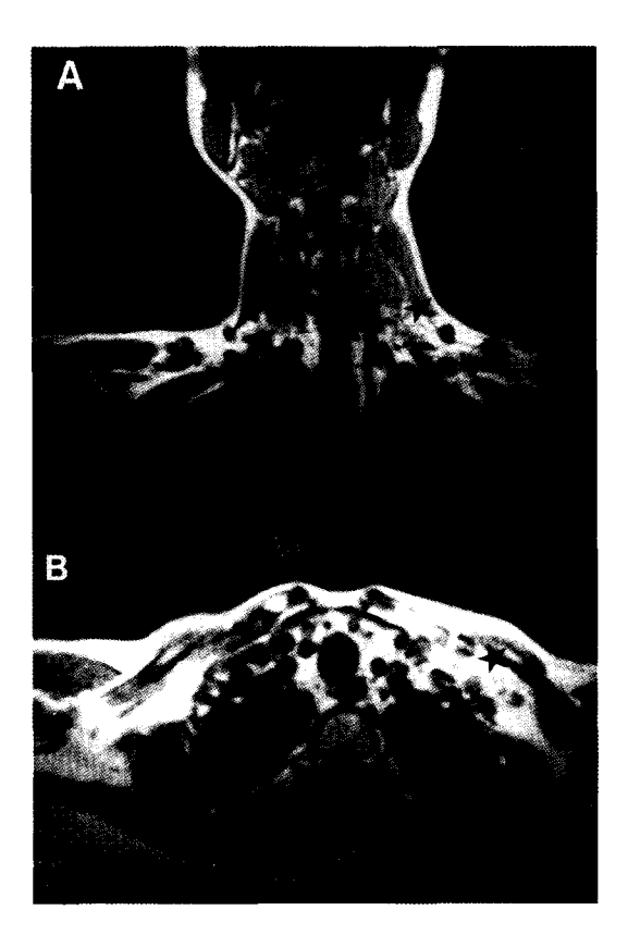
Fig. 3. Coronal (A) and axial (B) T2-weighted MR scan of the neck (case 2). The left supraclavicular fossa is marked by a star. The MR scan shows multiple small lymph nodes (<1cm) and ectatic lymph vessels. A diffuse thickening of subcutaneous tissue is seen compared with the contralateral side.

intraoperative finding showed the supraclavicular fatty and connective tissue close to the internal jugular vein to be characterized by abundant ectatic lymph vessels at the junction of the thoracic duct. These tissues were removed en toto. The thoracic duct, which entered the mass, was ligated to minimize lymphorrhea. Four months after the operation, she complained of similar symptoms on the opposite side of the neck. Palpation revealed a non-tender mass situated in the right supraclavicular fossa. Ultrasonography showed a 2.5 x 2 cm mass with ill-defined margins behind the sternomastoid muscle. The sonographic