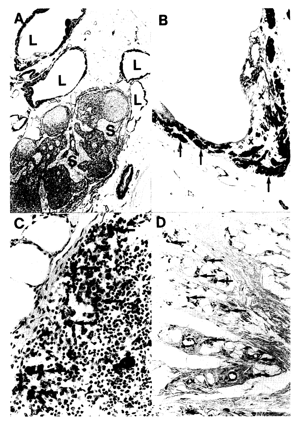
Fig. 5. A) Lymph node with intact basic structure and slightly enlarged sinuses (S) (case 2). The lymph node is surrounded by ectatic lymph vessels (L). Smooth muscle fibers in the wall of lymph vessels are marked black by muscle-specific antigen (see also B). 45x magnification, anti-SM-actin labeling. B) Lymph vessel from A at 180x magnification. The lymph vessel is characterized by prominent smooth muscle fibers (arrows) and loosely packed, fiber-rich interstitial connective tissue (X). Anti-SM-actin labeling. C) Marginal sinus of a lymph node with scattered, KP1-positive macrophages (marked black, arrows). Magnification 360x, KP1 (CD68). D) Fiber-rich connective tissue with an increased content of scattered tissue mast-cells (arrows). Magnification 180x, Naphthol-ASD-Chloracetatesterase-stain.