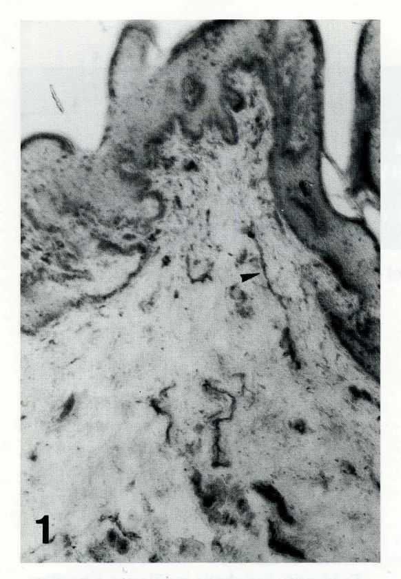
Fig. 1. A guanylate cyclase positive capillary (arrowhead) was chosen for electron microscopy. x75 (see Fig. 2)

Guanine triphosphate is converted to cyclic 3,5'-guanine monophosphate by guanylate cyclase, cyclic GMP to 5'-guanosine monophosphate by phosphodiesterase and 5' guanosine monophosphate to guanosine by 5'-nucleotidase. Goldberg et al (6) suggest that adenylate and guanylate cyclases, despite seemingly antagonistic function, maintain balanced activity. Inhibition of these enzyme reaction by lead nitrate is controversial. LeMay et al showed that boiled tissue maintains cyclic AMP activity if adenylate cyclase is added to the reaction (7). Cutler, on the hand (8), showed that lead nitrate inhibited adenylate cyclase reaction. Fujimoto et al (9) maintained that this inhibition by lead nitrate is of minimal consequence. Our control specimens with tissue omitting the guanylate immunodiphosphate substrate and