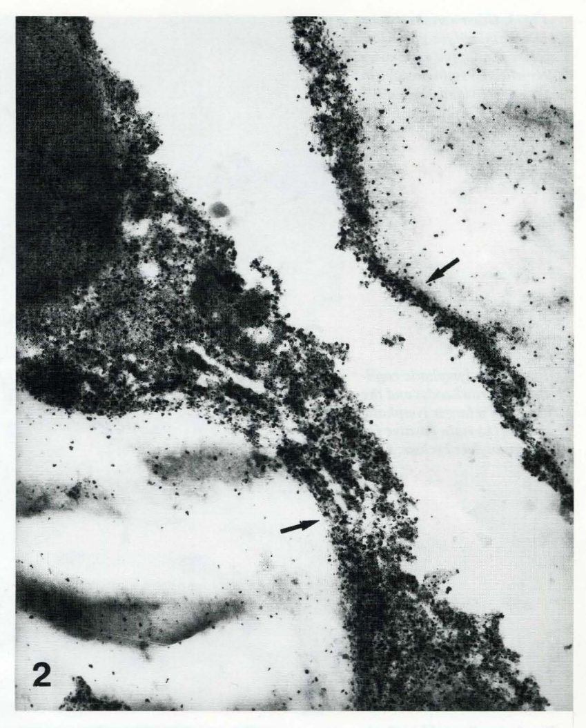
Fig. 2. The microvessel shown in Fig. 1 demonstrates positive staining endothelial cells for guanylate cyclase (arrowheads) and lacks pericytes consistent with a lymphatic capillary. Electron micrograph x6,700

alkaline phosphatase which stains positive for blood capillaries, histochemical enzyme staining of the microvessels with guanylate cyclase may also help distinguish lymph from blood capillaries.