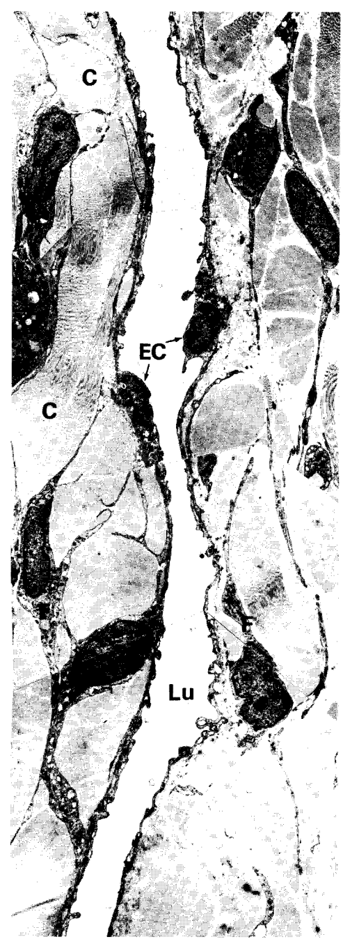
Fig. 4. A segment of an absorbing periadventitial lymphatic encircling the wall of a rabbit carotid artery like a laminar plexus. Lu=lumen, EC=endothelial cells, C=collagen bundles, F=fibroblast. Original magnification x1650.