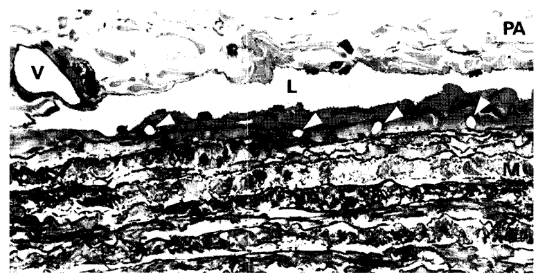
Fig. 1. A large absorbing periadventitial lymphatic in the rabbit thoracic aorta. Four blood capillaries (white arrowheads) are visible at the media-adventitia border. L=lymphatic, V=venule, M=media, A=adventitia, PA=periadventitial connective tissue. Electron microscopy confirmed that (L) was a lymphatic. Original magnification was x160.