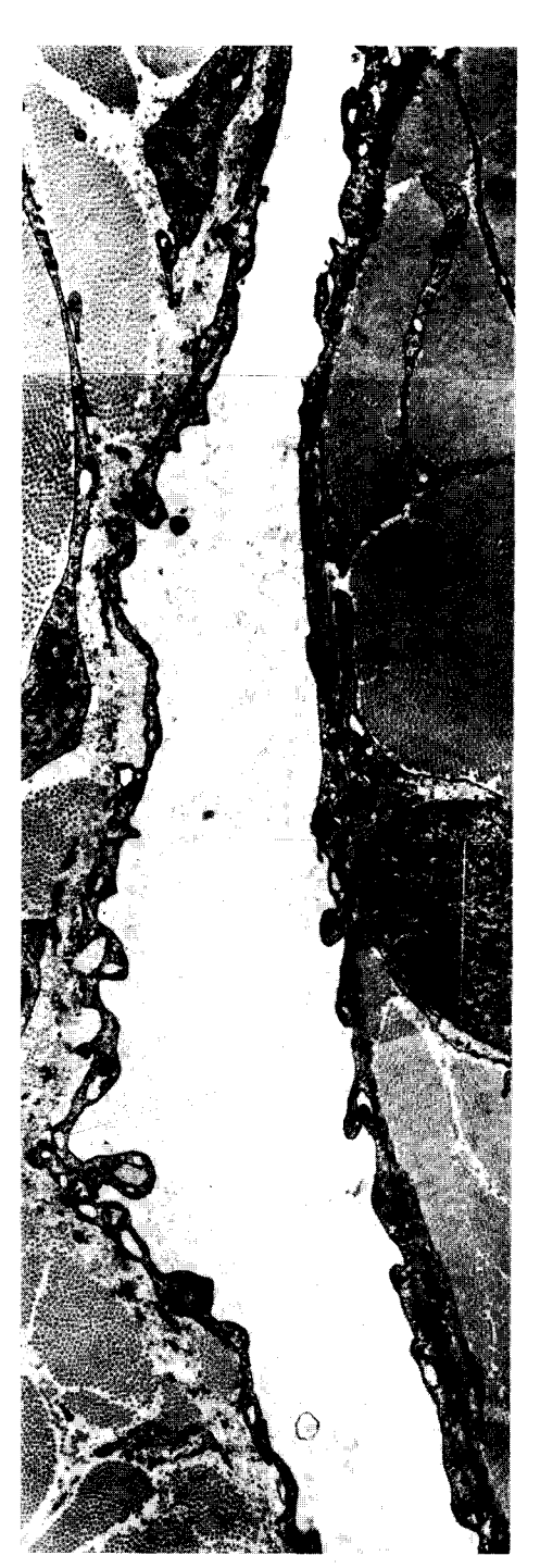
Fig. 5. Higher magnification of the lymphatic shown in Fig. 4. The endothelial profile is typical of lymphatic: thin and irregular with many folds and luminal digitations. Original magnification x4500.