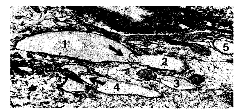
Fig. 1. Photomicrograph of dilated lymphatic vessels in a 36 week old fetus as derived from reconstructed drawings. Arrows point to intraluminal valves. Sirius Red Hematoxylin (x56).