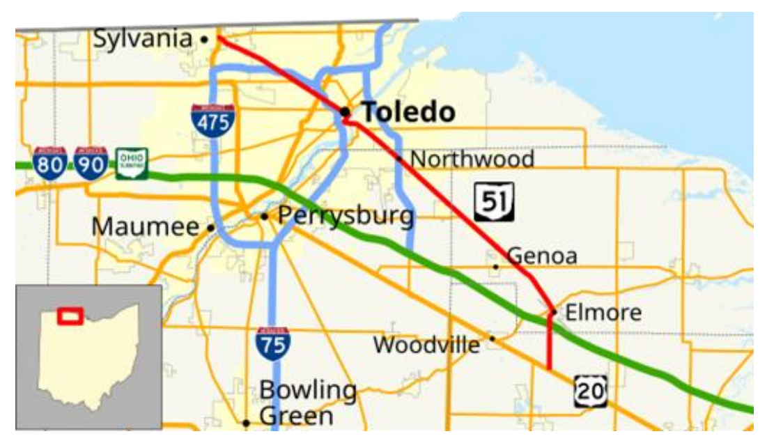
Figure 1: Toledo and Perrysburg in relation to Ohio.

The combination of global climate change mitigation policy, company efforts at decarbonization and investments into lower-carbon infrastructures makes solar manufacturing an important site of research and reflection. The article proceeds by briefly discussing the research design employed, a mixed-methods approach consisting of expert interviews, community interviews, focus groups and document analysis. The following section provides a background on First Solar, and solar panel manufacturing within the United States. This is followed by discussing the literature on the political ecology of manufacturing and lower-carbon infrastructures, specifically around ideas of environmental and energy justice, which precedes the main research findings organized by emergent themes. This leads to a conclusion reflecting on the findings alongside highlighting structural political and economic issues, but also discussing the recommendations from research participants and general observations.