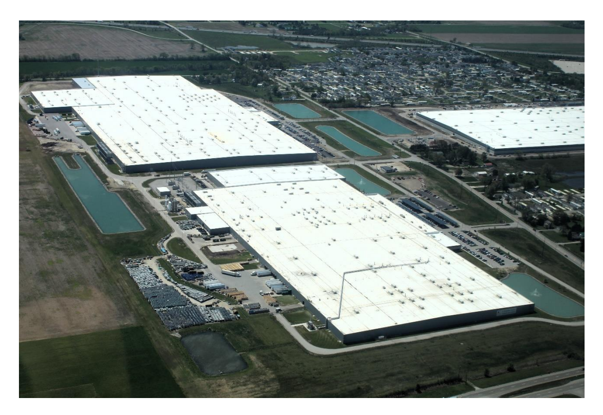
Figure 2: First Solar assembly, recycling and R&D expansions in Perrysburg, Ohio, 2024.

First Solar currently specializes in the design, manufacturing and marketing of utility-scale photovoltaic solar modules. The recent net sales of PV panels are distributed geographically as follows: the United States (96%), France (2.1%), Japan (0.2%), and other (1.7%) (MS, 2024). The annual manufacturing capacity, according to First Solar (2023b, p. 11), "has grown from 15 megawatts (MW) in 2002 to 9.8 gigawatts (GW) as of December 31, 2022." The company, with the support of the IRA, has committed to over US$2.8 billion in capital investment and 7.9 GW of additional manufacturing capacity in the US (FS, 2023a, p. 11).