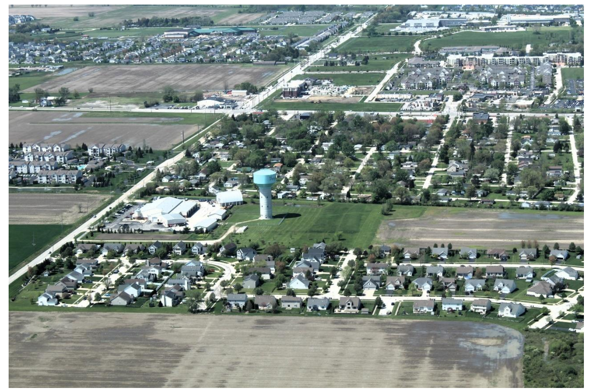
Figure 7: Houses outside downtown Perrysburg seen from the air.

larger off-site project."<sup>68</sup> Overcoming the regulations would mean energy conversion technologies and new manufacturing equipment to produce different sized solar panels. Lightning also hits the roofs of these First Solar facilities (Pickerel, 2024), which might dissuade covering the enormous roof surface area with solar panels.