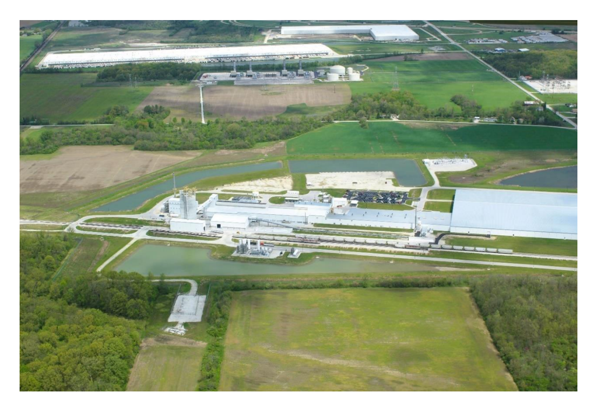
Figure 8: NSG Glass (bottom structure) and the Troy Energy Facility (top structure), a 796MW Gas Fuel Oil power plant providing heat and energy to the factory, 2024.

NSG glass is located next to a natural gas power plant (see Figure 8). Heavy industry in the Ohio grid is running on coal, oil, nuclear and natural gas. There are notifications of oil pipelines going into First Solar's new R&D facilities (see Figure 9). "Funny thing about First Solar," Barry admits, "they don't have any arrays on their buildings, or next to any of the facilities they built, and all the power comes from the coal plant." "I mean, I'm a nature person I love and I just like it; we need to preserve it, not destroy it," explains the mother, but "that is pretty much what they're [First Solar] doing: Destroying nature in order to do something to preserve it." She speaks in the context of factory expansion, which is another factor in addition to mining raw materials, smelting, transportation and decommissioning of panels.