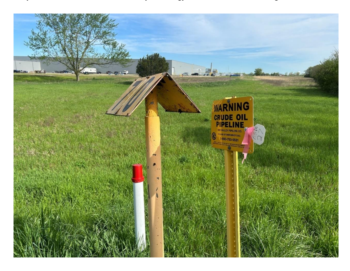
Figure 9: Crude oil pipeline warning with the First Solar R&D facility behind it.

of their waste byproducts."<sup>69</sup> The material, energy and water intensive reality of lower-carbon infrastructures (Mulvaney, 2019, 2024; Dunlap, 2023; Stock & Ptak, 2024), not to mention their waste streams, are a daunting issue (Sovacool et al. , 2020; Sovacool & Stock, 2024). This extends to the widespread under-accounting of environmental effects and waste in mining in general (Svobodova et al. , 2022; Maus & Werner, 2024), but also in the material demand predictions that exclude assessments of secondary infrastructures required for solar panels, such as high-voltage powerlines, energy transformers and battery storage technologies (Neukirch, 2020; Dunlap, 2023; Archer & Calvão, 2024). There is mining necessary for the so-called green digital or 'smart' infrastructures (Bresnihan & Brodie, 2021; Brodie, 2024). This is why, in matters of mining and production, Alex says, "There are no free lunches"—every technology has an extensive socioecological cost.