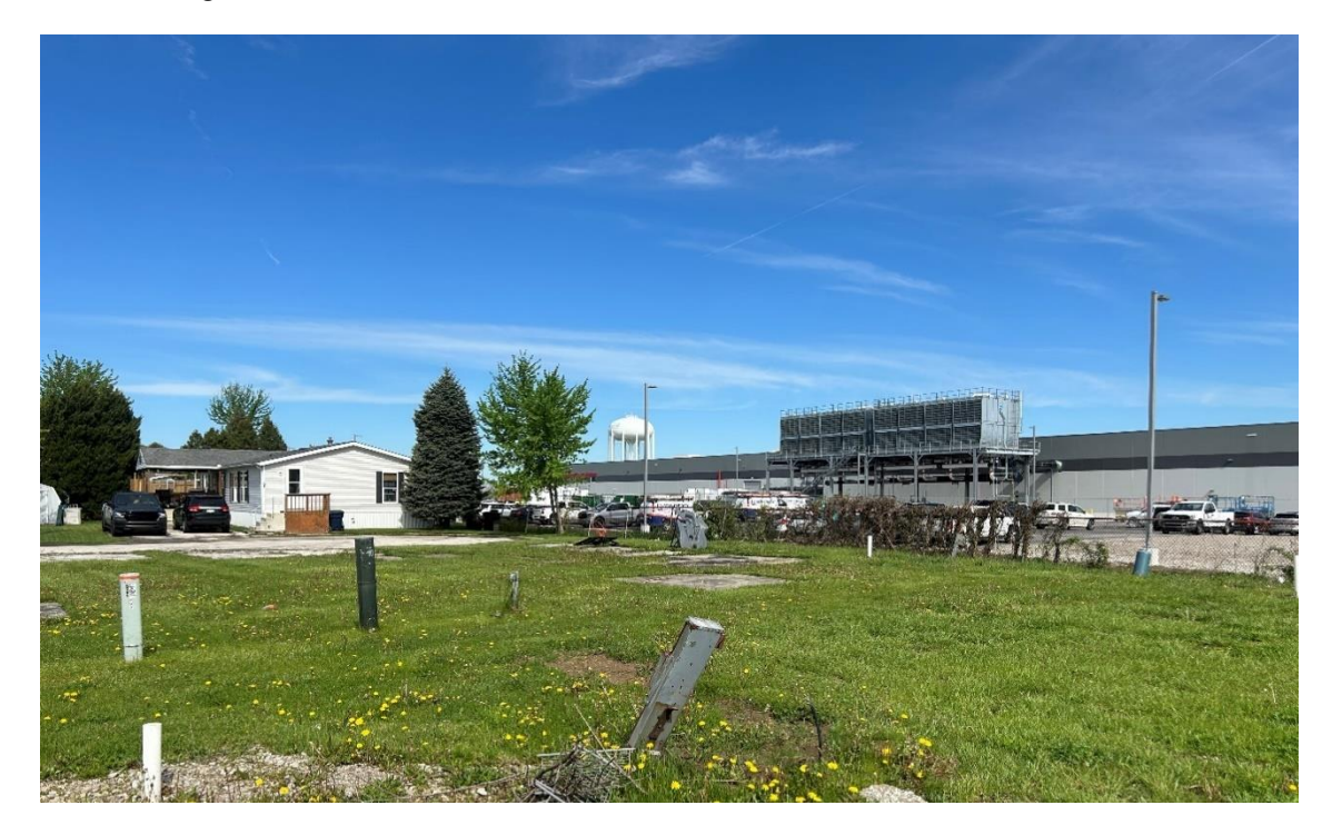
Figure 4: R&D Facility under construction seen from the vantage point of the Friendly Village Estate, 2024.

of damn buildings<sup>#1</sup> and its "a building that takes a country mile."<sup>42</sup> As the estate agent said, "it's just another factory," which even passively positive residents felt was "kind of eye-sore."<sup>43</sup> Another resident explains: "We had a nice view out here at one time, but now we're looking at a factory."<sup>44</sup> An ex-employee exclaimed: "But I mean, the buildings are ugly as shit."<sup>45</sup> While I do not think many people would disagree with this sentiment, it enraged some residents, and a mother explains: "but come on, I f#%king live here. I don't want to live between all these buildings."<sup>46</sup>