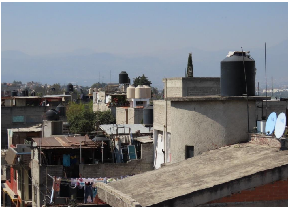
Figure 4: Water tanks (" tinacos " in Spanish) in Iztapalapa.