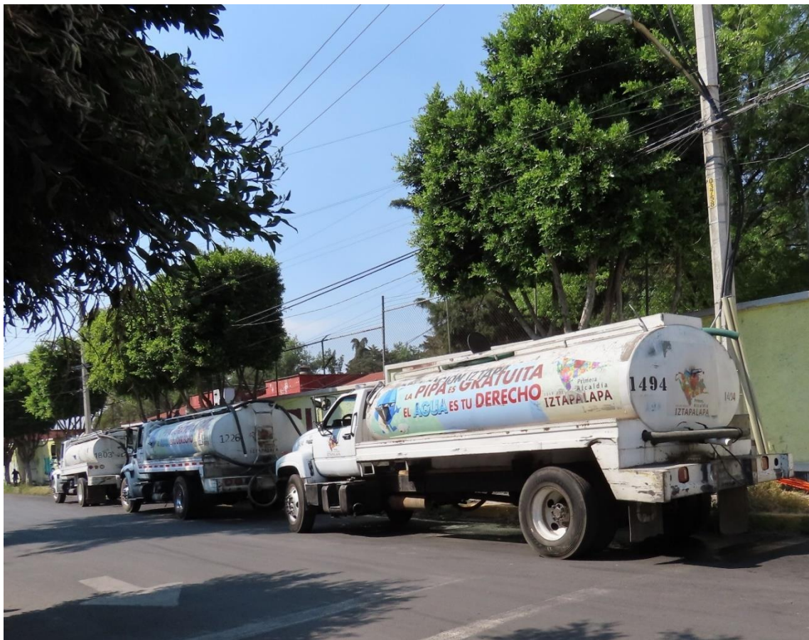
Figure 2: A water truck with the inscription: "The truck is free, water is your right" (" La pipa es gratuita el agua es tu derecho " in Spanish).

An in-depth analysis of the interrelations between the MGBs and their financing of two water infrastructure projects—namely, the Selene plant and the Vicente Guerrero infrastructure—reveals two critical findings. First, both projects are insubstantial responses to the structural problems of Mexico City's hydrosocial cycle, including flooding, surface collapse due to groundwater overexploitation, intermittent access to water, and the associated time poverty experienced by women. Second, they are not "green" projects, countering the narrative of climate action promoted by the MGBs, as explained in the subsequent two sections.