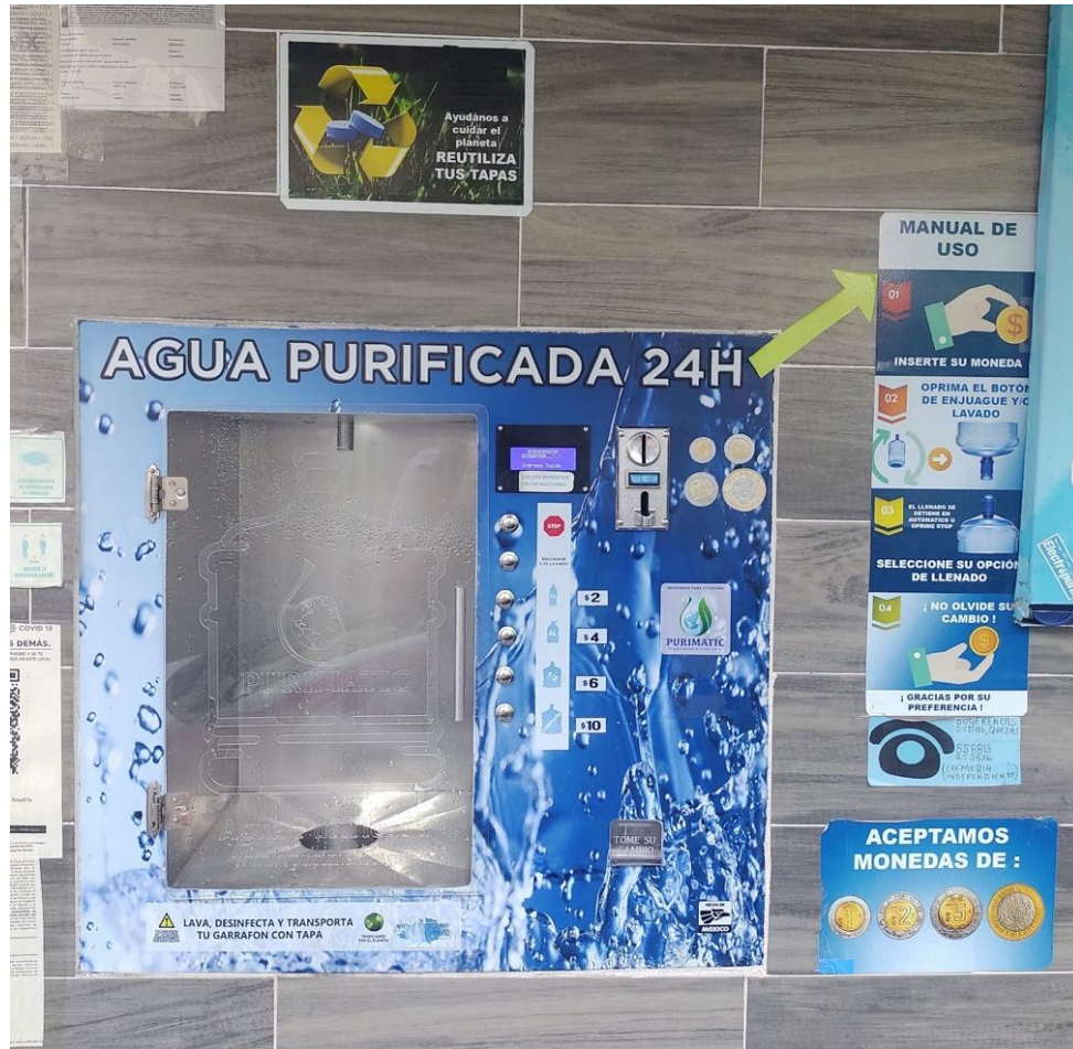
Figure 5: Automated distribution point ("ATM") of water.