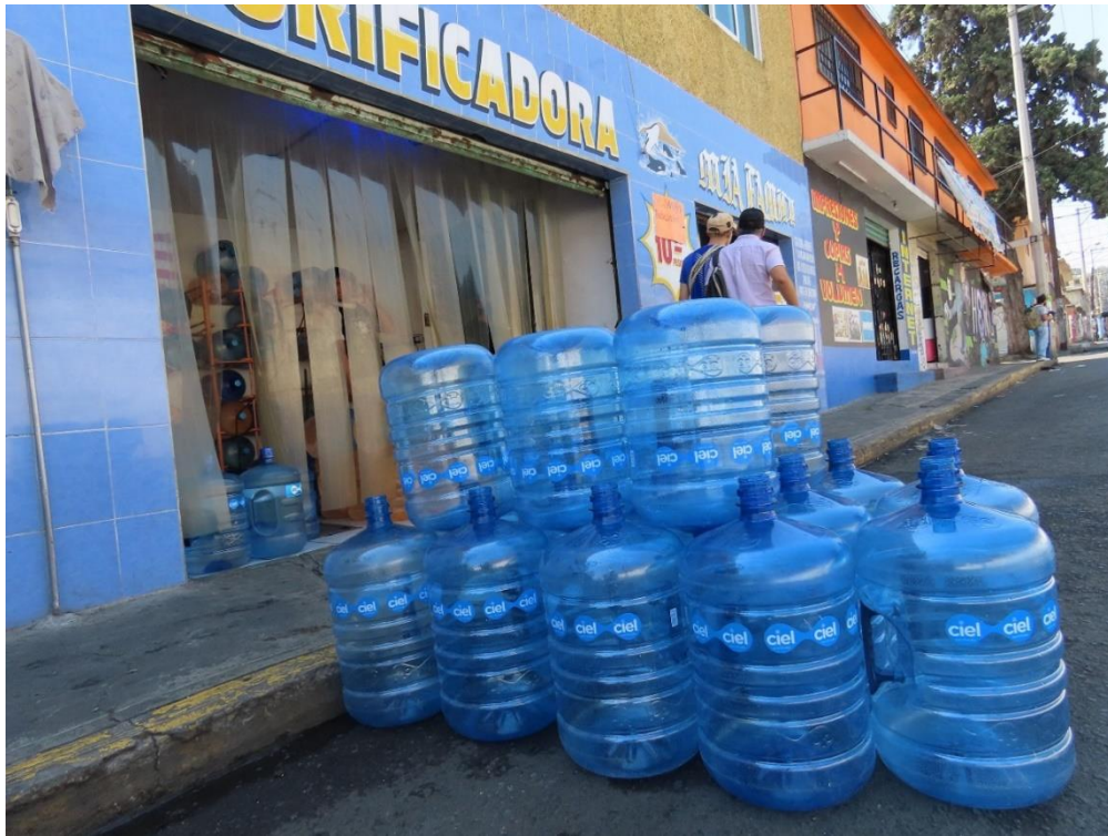
Figure 3: Bottled water business in Iztapalapa.