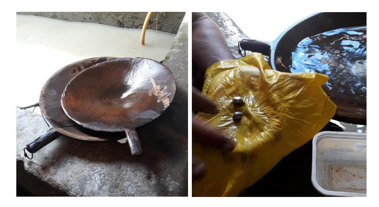
Figure 3 (left): Traditional gold pan (batea) used to recover the mercury amalgam in artisanal gold processing. Figure 4 (right): Worker recovering mercury amalgam by squeezing it through a cloth. Visits to entables, Segovia, 11 May 2019.