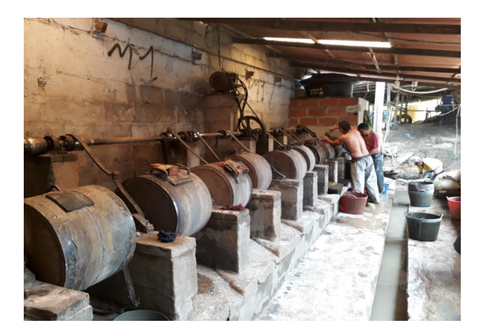
Figure 2: Workers operating ball mills ( cocos ) in artisanal gold processing facility. Visits to entables , Segovia, 11 May 2019.