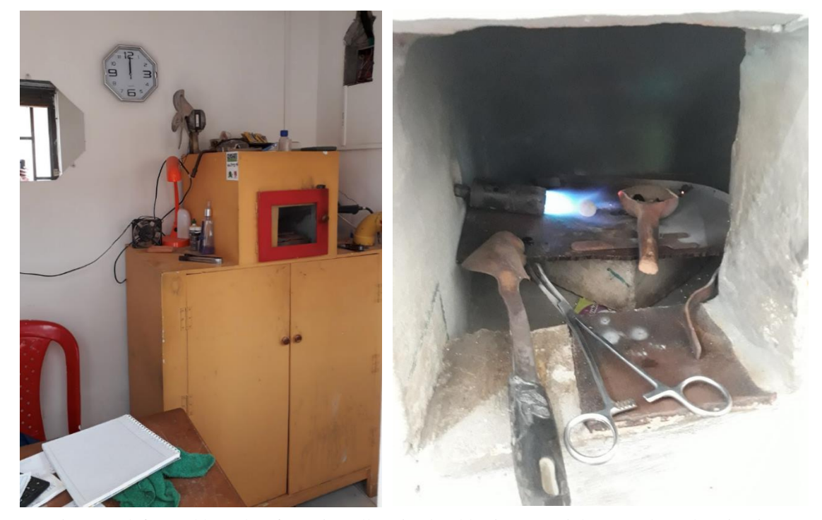
Figure 5 (left): Gold smelter for artisanally mined gold. Figure 6 (right): Amalgam burning in gold smelter for artisanally mined gold. Visits to gold smelting shops, Segovia, 11 May 2019.