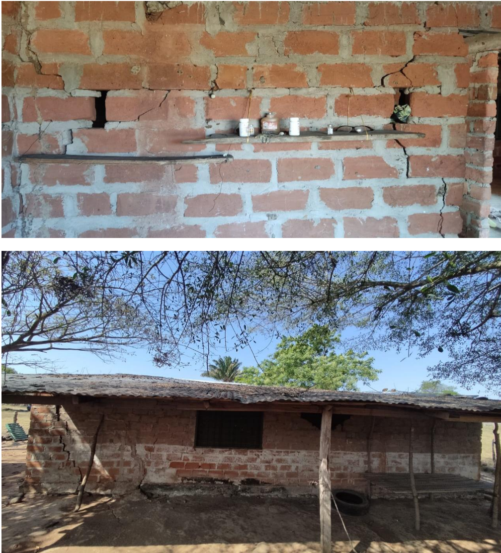
Figure 6 & 7: Possible cracking of housing.

Different companies in Cesar have been investigated for their poor environmental practices. Since the early 2000s, Drummond and Glencore-Prodeco have faced complaints of inadequate wastewater management, the non-construction of living green barriers, and coal dust emission along transportation routes (Tierra Digna, 2015; Garay-Salamanca, 2013; Observatorio de Conflictos Ambientales, 2017). Carbones La Jagua has been inspected for illegal forestry activities and the mishandling of suspended particulate matter and toxic waste (Defensoría del Pueblo, 2010; Tierra Digna, 2015). Other companies have been investigated for inadequate revegetation of roads, the installment of irregular perimeter canals, the dumping of waste material into bodies of water (some of them without any authorization), the use of water without having been granted a concession, and atmospheric emissions similar to the ones reported for the aforementioned groups (Defensoría del Pueblo, 2010; Fundación Ideas para la Paz, 2016; Garay-Salamanca, 2013; Tierra Digna, 2015).