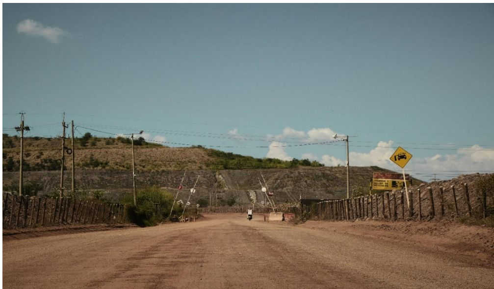
Figure 4: Coal waste dumps.

The excluded at the world's resource peripheries might undertake an accommodating / rentist / developmental / extractivist conduct, at least for a while, while they believe that minerals are the way out... (because) natural resource commodification brings with it the promise of local development opportunities.