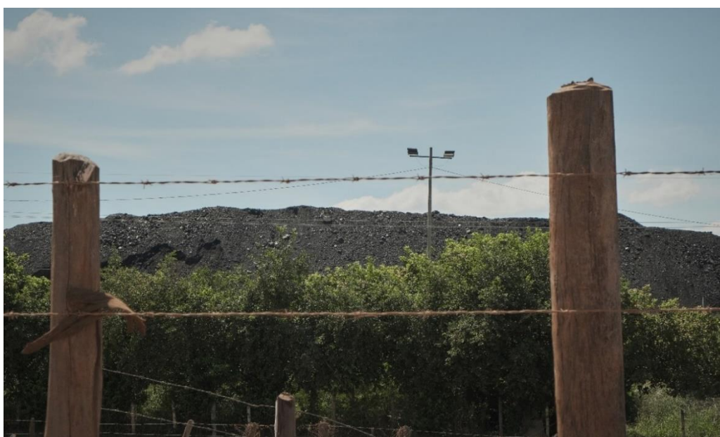
Figure 3: Mountain of coal rubble that extends for more than one kilometer.

In an atmosphere of dissatisfaction with the highly toxic and plundered landscape, coupled with a lack of studies of the damage to infrastructure, and especially to the health of bodies and ecosystems, two concerns of leaders and families stand out. The first are the ecosystem and territorial damages that not only refer to serious ecological deterioration, for example resulting from the presence of mountains of coal waste, as shown in Figures 3, 4 and 5. The second is the collective health of residents, people awaiting relocation and mining company workers.