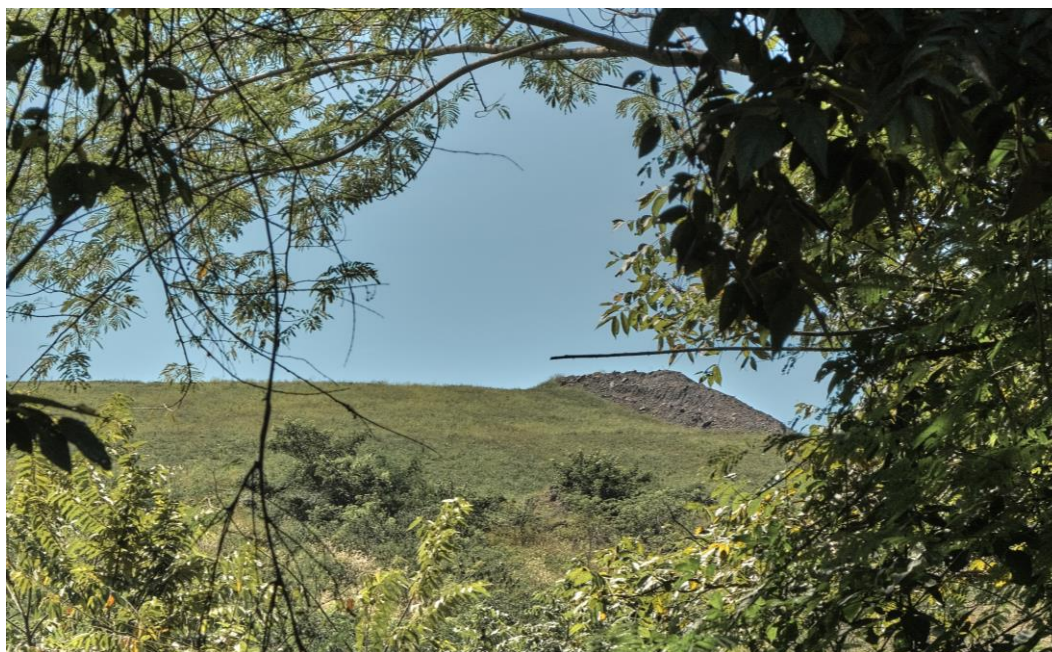
Figure 5: Coal waste dumps.