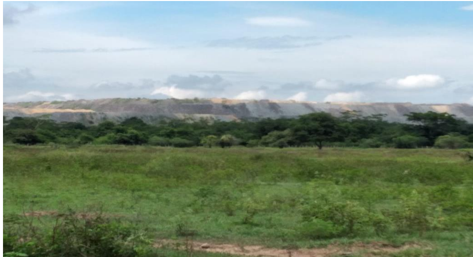
Figure 8: Landscape near the second case, with coal refuse.

administrative stage, twice the national rate (26%). In 2020, this reached 65% and 68% of the total number of applications submitted. Likewise, while in Colombia between 5% and 5.8% of the cases have ended with a verdict issued, in Cesar this proportion was only 3% (227 verdicts out of 7,500 requests in 2018, and 412 in 2020), the second lowest region in the nation.