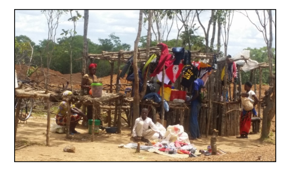
Figure 5: Small businesses at Jack mine.

Kabundi therefore, has become a hub of socio-economic activities around manganese mining. An interview with a health professional at Kabundi clinic revealed that with the arrival of people from outside the area, the clinic has been recording an exponential increase in sexually transmitted infections. The Sulutani of Kabundi also revealed that he has been receiving an increased number of marital-related disputes attributed to the fast-changing socio-economic dynamics in the area. Tobacco production and manganese mining reveal positive as well as negative outcomes in Nansanga. That is, in the absence of a 'win-win-win situation' according to the original plan for the area, the emergence of tobacco production and manganese mining contributes only partially to the realization of objectives laid down for the original farm block program. We discuss this further in Section 4.