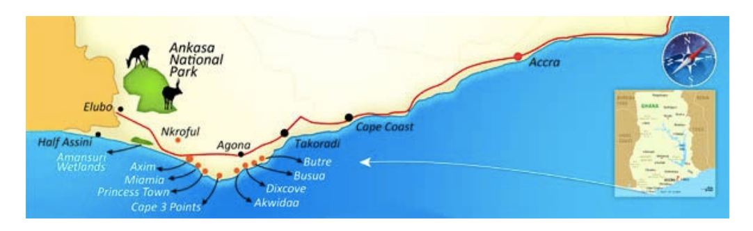
Figure 3: Towns on Ghana's West Coast.

The sample comprised elite interviews (n=40) involving corporate executives, government officials, representatives of international organizations, NGO representatives, academics and members of the mass media; community interviews (n=17) involving traditional authority and fisherfolk in selected communities; and six focus groups (n=27) involving fisherfolk, youth and members of community-based organizations. Following a purposive sampling technique, the total number of participants involved and the duration of