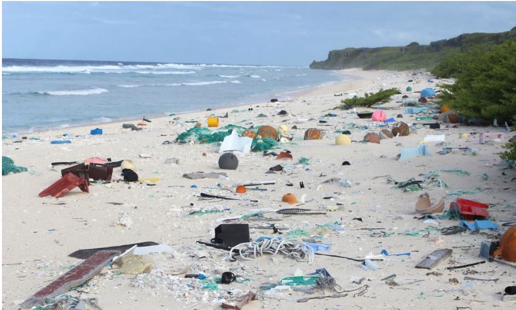
Figure 2: The Eastern coastline of uninhabited 'Henderson Island' ('Pitcairn Group', 24°22'30"S 128°19'30"W).

However, microplastics have been found in 25% of commonly consumed fish in Te Moananui (Forrest and Hindell, 2018), potentially transmitting associated toxins to consumers (Rochman et al. , 2015).