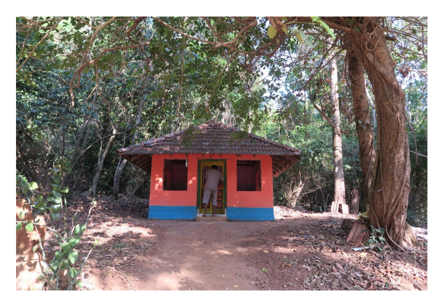
Figure 3: A spirit shrine worshipped by the Kunbi in the forest.

In addition to shifting cultivation, the Kunbi people had a strong relationship with the forest wildlife. They hunted three species of deer, sambars (<u>Rusa unicolor</u>), muntjacs (<u>Muntiacus muntjac</u>) and chevrotains (<u>Tragulus</u>), boars, and porcupines; collected honey from giant honeybees; and harvested useful plants. Among the wildlife in the forest, the sambar and Indian bison held special significance during the rituals performed by the Kunbi people, and they considered tigers and snakes to be forest spirits and worshipped them. Among the Kunbi rituals, group hunting ( bhondi ) was performed by adult males before the millet harvest and festival; it was particularly significant because it determined the future prosperity of the village. According to the Kunbi informants, several places in the forest, particularly water sources, were endowed with the power of the spirits, and hunting rituals provided opportunities for individuals to interact with the spirits who governed their respective domains (Figure 3).