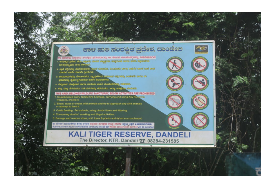
Figure 1: A noticeboard in the Kali Tiger Reserve.

Thus, the area now known as the Kali Tiger Reserve has been established as a key wildlife protection area since the late 1950s. It has had strict laws and regulations established to protect the natural environment. However, the Kunbi people who have lived in the area have suffered from this protected designation. The Kunbi people who dwell in Uttara Kannada are believed to have migrated from the neighboring state of Goa, and their mother tongue is Konkani. In Goa, individuals belonging to the Kunbi community are recognized as "scheduled"