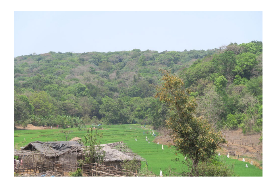
Figure 2: The landscape around a Kunbi hamlet in the Kali Tiger Reserve.

The Kunbi people residing in the forest formed villages comprising patriarchal families. The boundaries of each village were marked by natural landmarks such as rocks or streams. Anything that grew within the boundary of a village belonged to the village inhabitants, and any outsiders seeking something from that village required permission from the village chief ( buduant ). If the Kunbi inhabitants discovered that someone had procured produce from their territory without permission, the priest of the village ( mirashi ) would pray to the guardian spirit ( payak ) and request that it punish the thief.