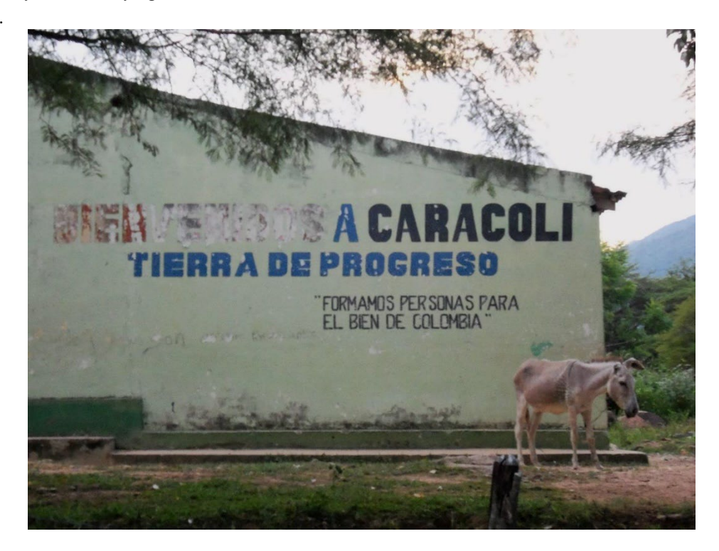
Figure 3: A house in the town in Caracolí. The sign reads: "Welcome to Caracolí. Land of progress. 'We shape people for the good of Colombia'."

programs, compensation and in the case of Caracolí, on tourism as an expected consequence of the dam and an opportunity for diversifying sources of income