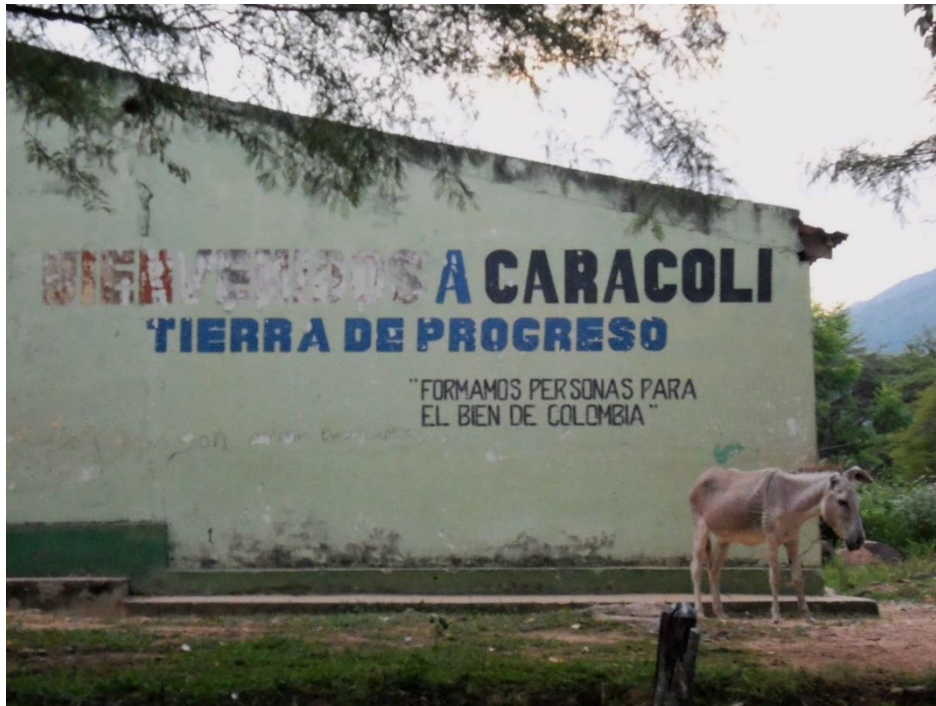
Figure 3: A house in the town in Caracolí. The sign reads: "Welcome to Caracolí. Land of progress. 'We shape people for the good of Colombia'."

programs, compensation and in the case of Caracolí, on tourism as an expected consequence of the dam and an opportunity for diversifying sources of income