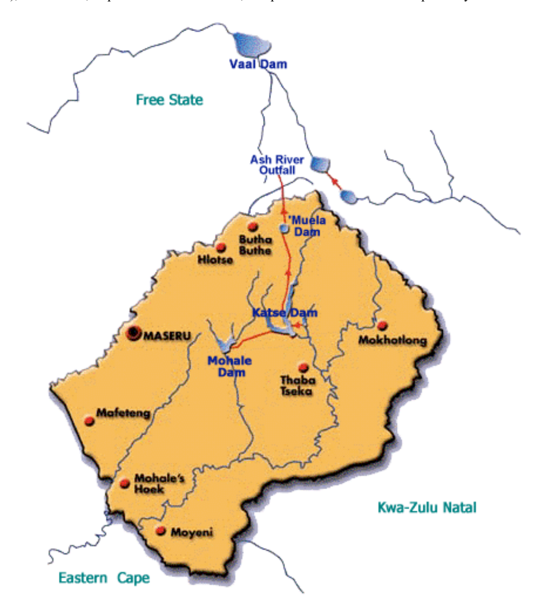
Figure 3. Map of Phase 1A and 1B, Lesotho Highlands Water Project (LHWP).

Development Authority (LHDA) 1986). Three dams have been completed, Katse, 'Muela (the hydropower station), and Mohale, as part of Phase 1A and 1B, completed in 1998 and 2002 respectively.