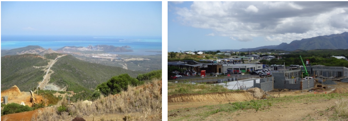
Figure 2: Koniambo project, from the mine to the smelter, with reef beyond. Figure 3: Filling station and other economic projects on customary land.

The construction of the Koniambo nickel smelter has been accompanied by urban development of the "VKP" region, comprising the three municipalities (Voh, Koné and Pouembout) and the smelter and industrial areas. This regional growth pole in the north of Grande Terre is the center of Grande Terre's 'rebalancing' effort, and includes ancillary businesses, retail malls, new housing, a hospital and educational and cultural services (e.g. a cinema, library, and swimming pool) (Figure 3). The overall geopolitical aim of the Northern provincial authorities is, as we have shown, to reclaim territory either as an independent nation, but if not, to demonstrate the ability of Kanak politicians to create jobs and services in the North province to counter Nouméa in the South (Kowasch 2012a).